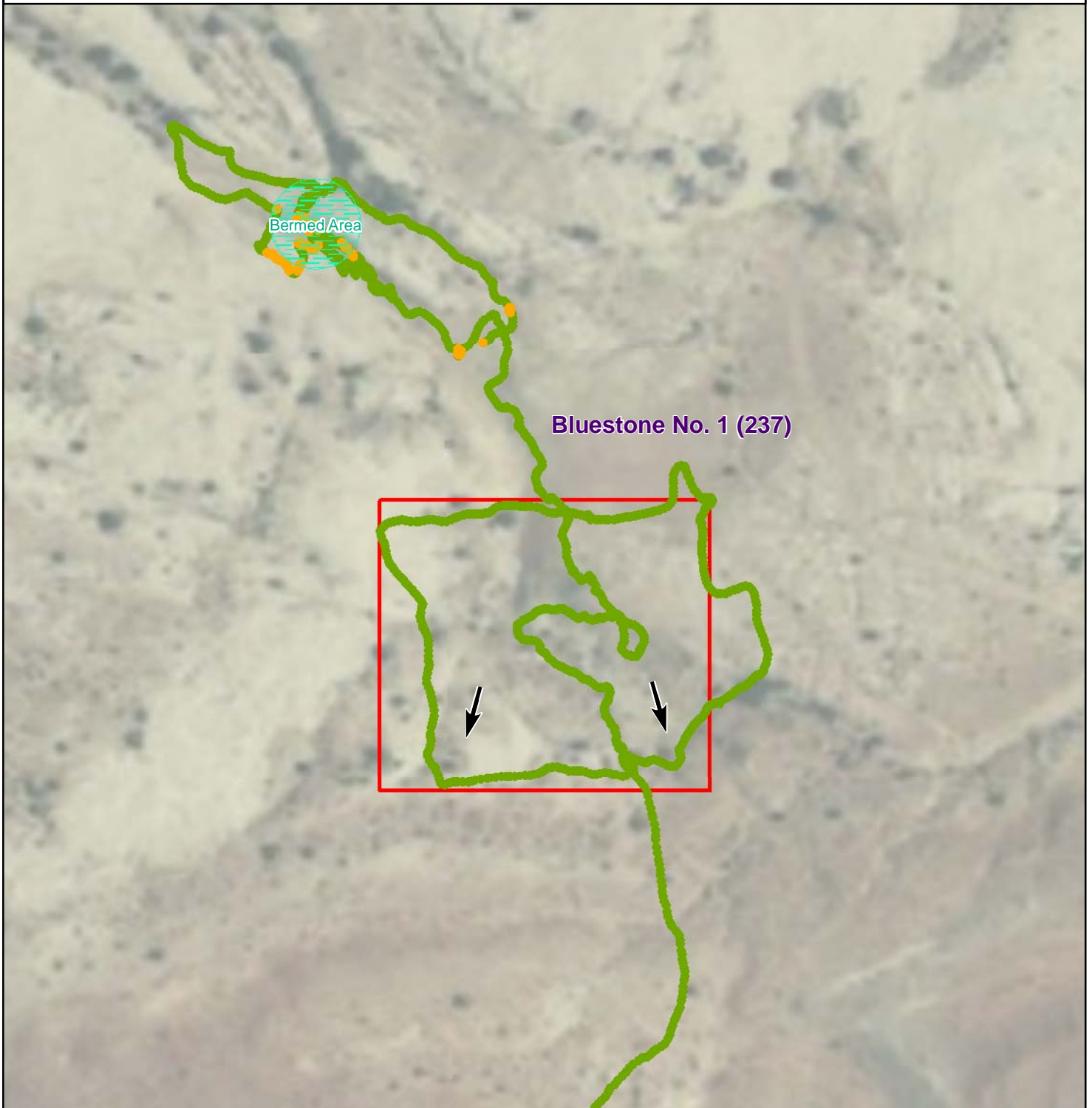
Figure 1 - Gamma Radiation Measurements, Above Two Times Background Bluestone No. 1 (237) Dennehotso Chapter, Navajo Nation