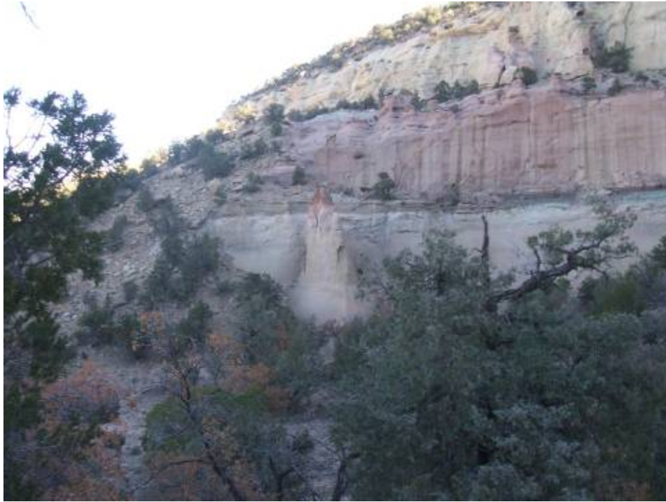
Photo 5. C D & S mine site, towards the northeast