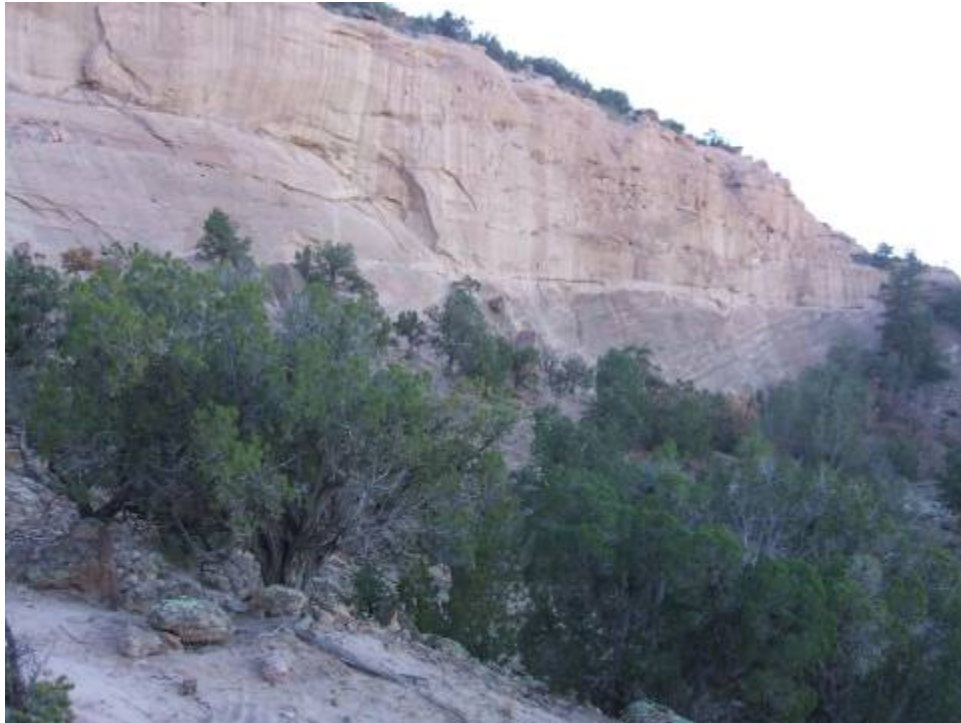
Photo 3. C D & S mine site, towards the southeast