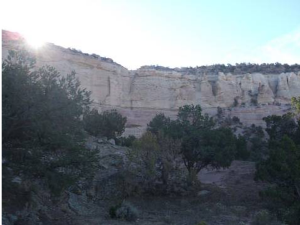
Photo 1. C D & S mine site, towards the south