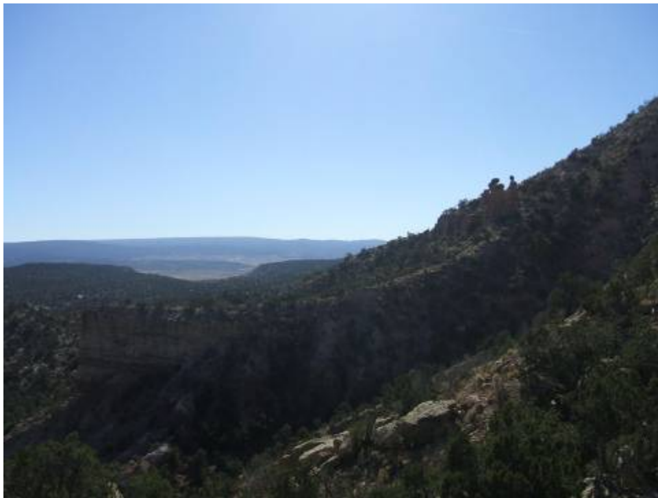
Photo 2. Westwater # 1 mine site ridge down-slope, east of cliff area, towards the southwest