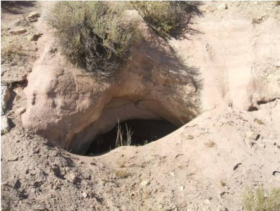
Photo 4. Westwater # 1 mine site shaft/adit along cliff face, towards the northwest