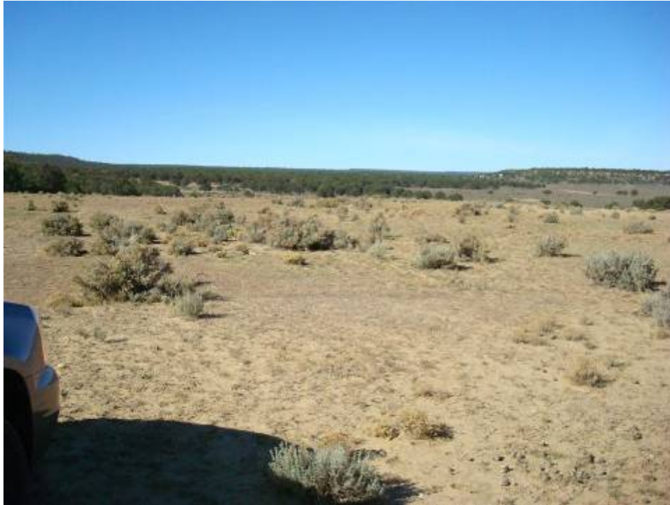
Photo 1. Ruby 1 Mine site, towards the west