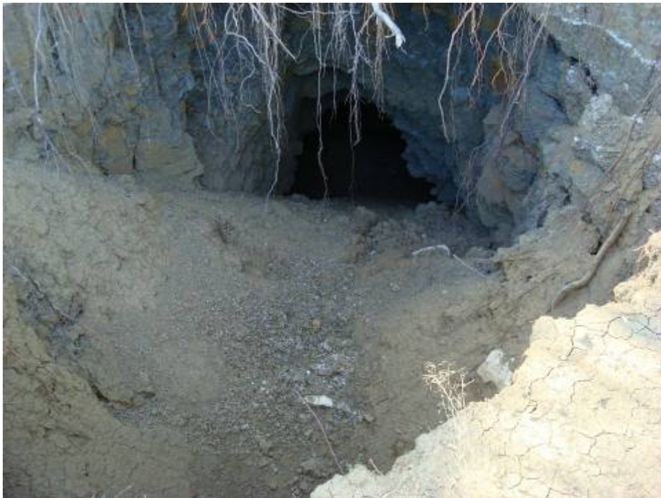
Photo 4. Ruby 1 Mine site, interior view of adit