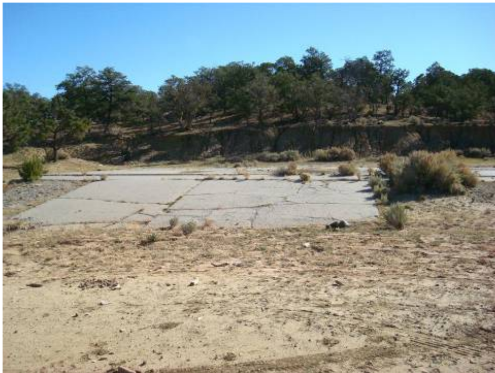
Photo 2. Ruby 1 Mine site, concrete slab on eastern portion of the site