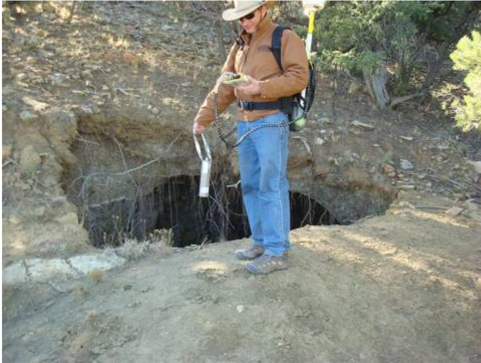
Photo 3. Ruby 1 Mine site, adit located on southern hillside