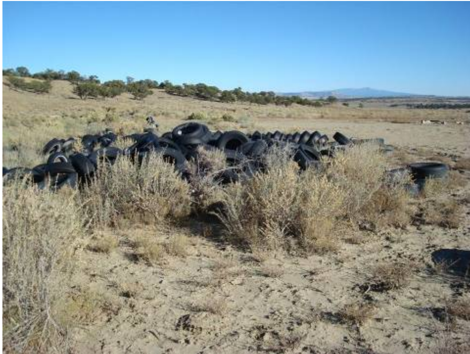
Photo 5. Black Jack No. 1, dumping of tires north of the mine.