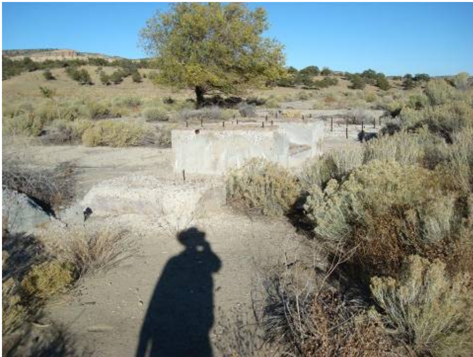
Photo 4. Black Jack No. 1 Mine site, mine workings.