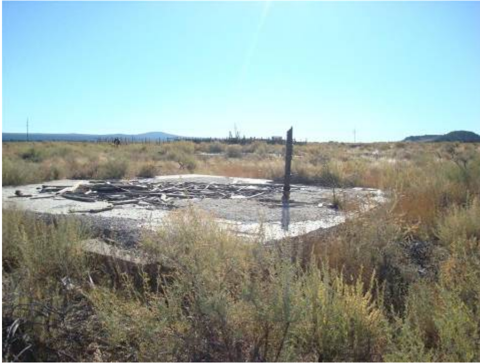
Photo 1. Black Jack No. 1 Mine site, possible former barracks.