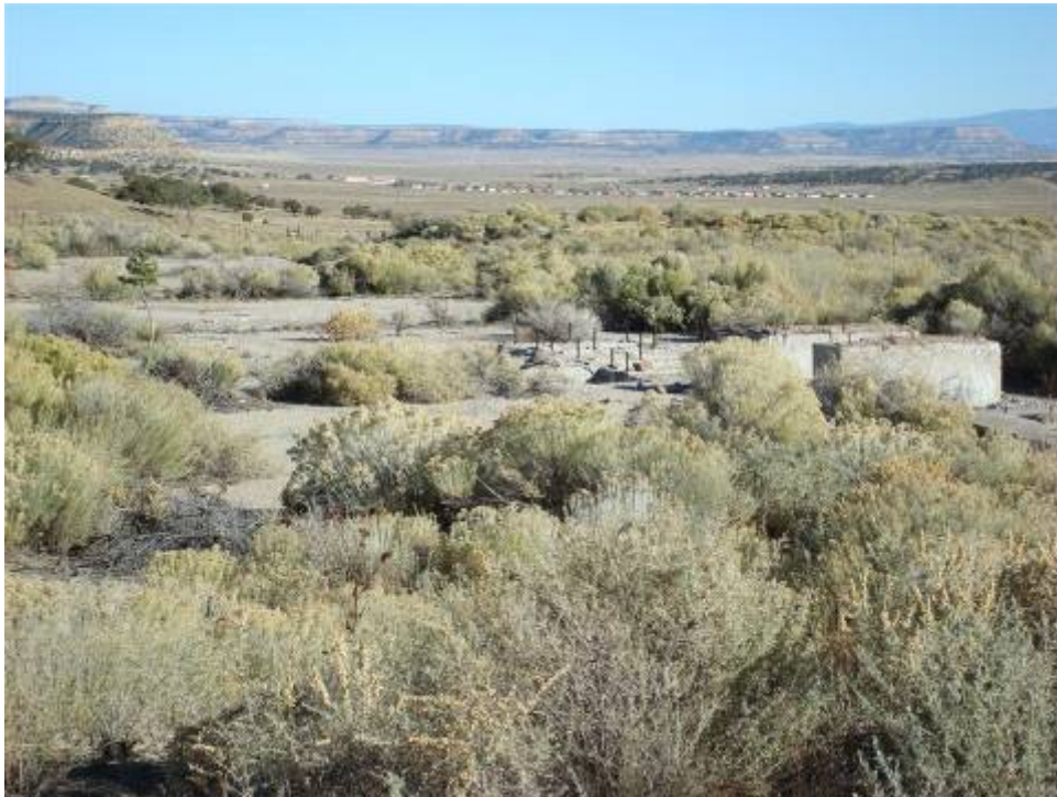
Photo 2. Black Jack No. 1 Mine site, ore processing area.