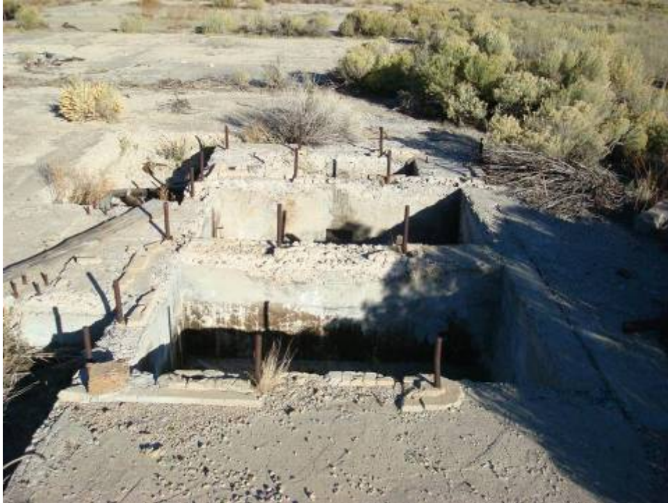
Photo 3. Black Jack No. 1 Mine site, clarifiers or vaults.