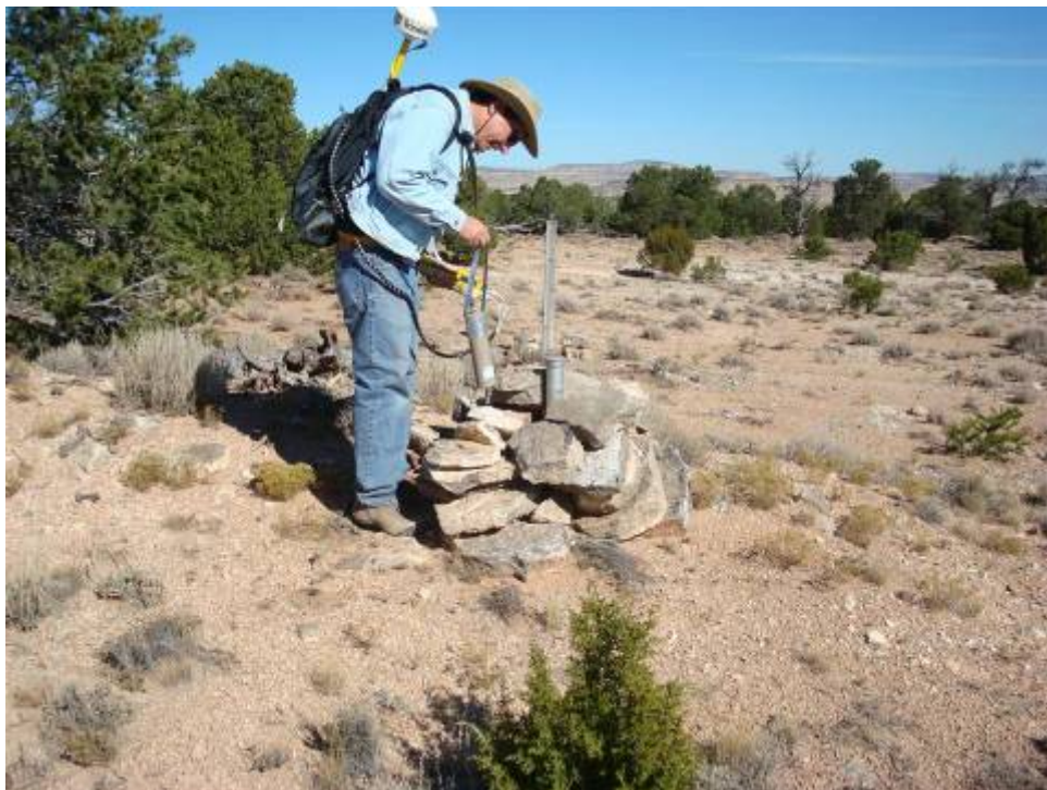
Photo 2. Elkins 326 Mine site, BLM cadastral survey marker