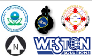
Gamma Radiation Measurements Elkins Mines Baca/Haystack Chapter Navajo Nation, New Mexico Figure 2