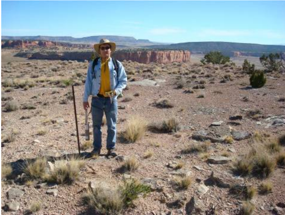
Photo 3. Elkins 326 Mine site, drill steel stuck in bedrock, towards north