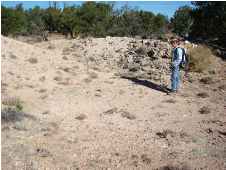
Photo 4. Elkins 327 Mine site, waste rock piles