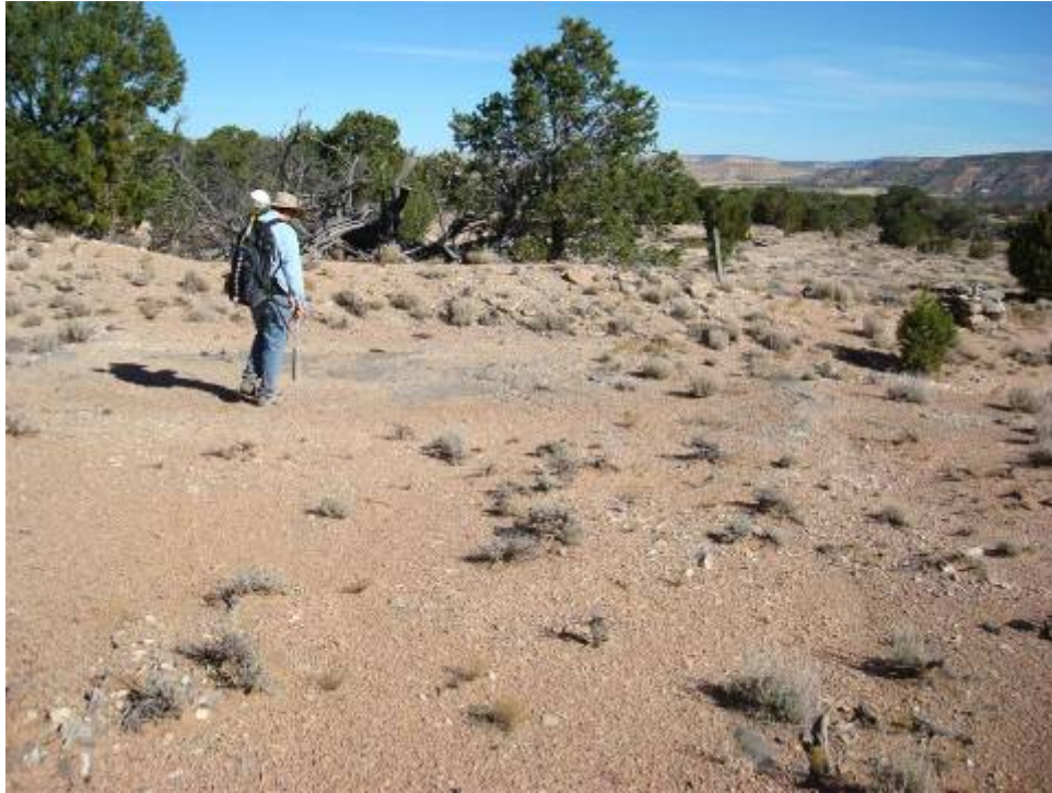
Photo 1. Elkins 326 Mine site, towards the north