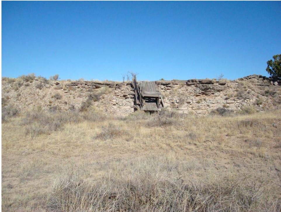
Photo 3. Haven Mine site with wooden chute at west end of mine