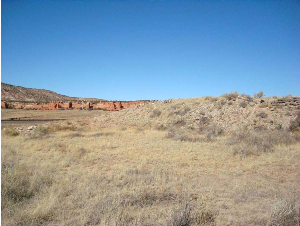
Photo 1. Haven Mine site, towards the north. Railroad in background.