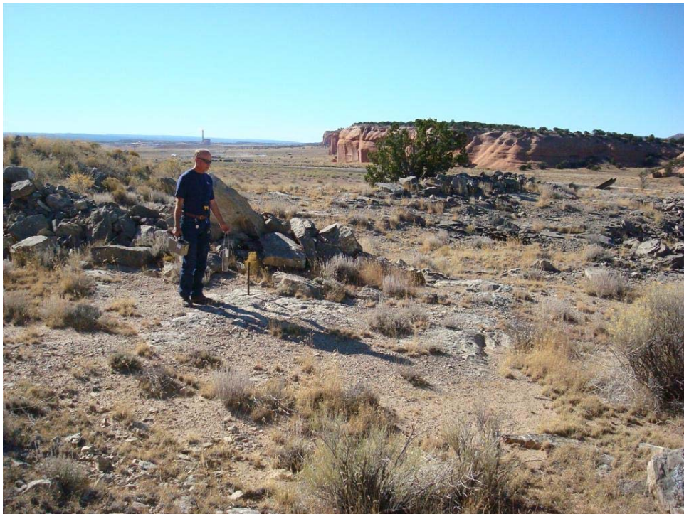
Photo 2. Haven Mine site, towards the northwest Waste rock piles and drill steel in bedrock