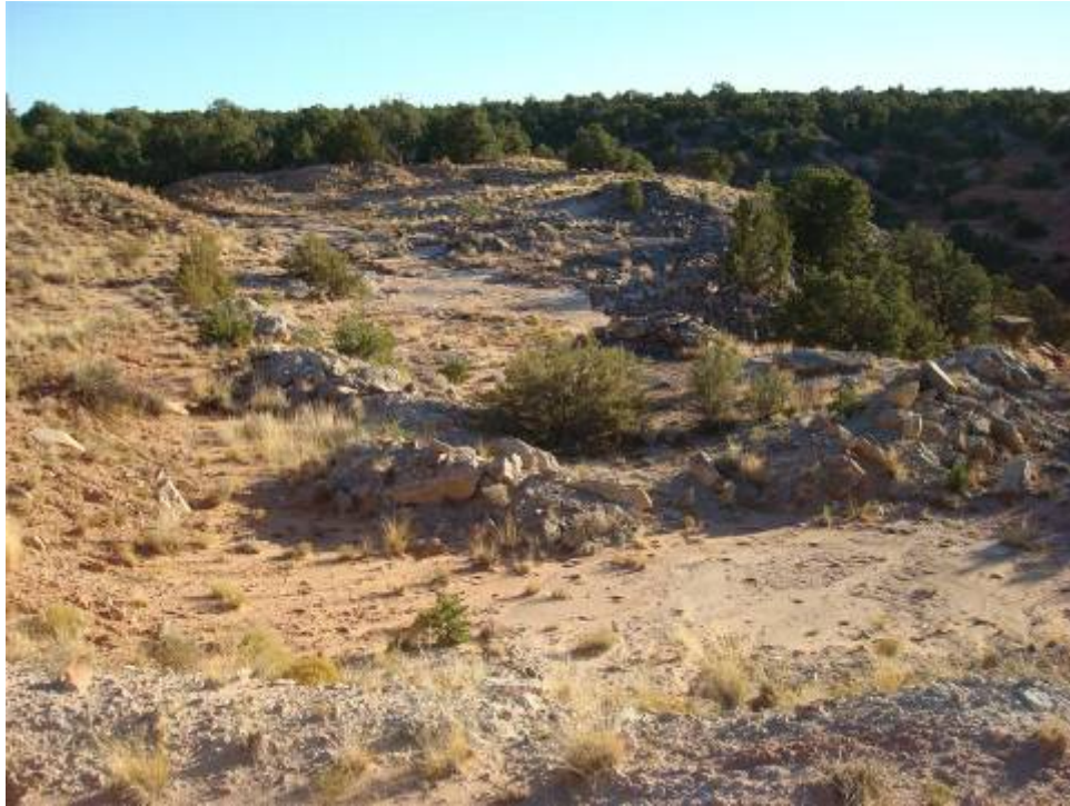
Photo 1. Yucca Mine site, towards the south