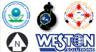
Gamma Radiation Measurements Above Two Times Background Yucca Baca/Haystack Chapter Navajo Nation, New Mexico