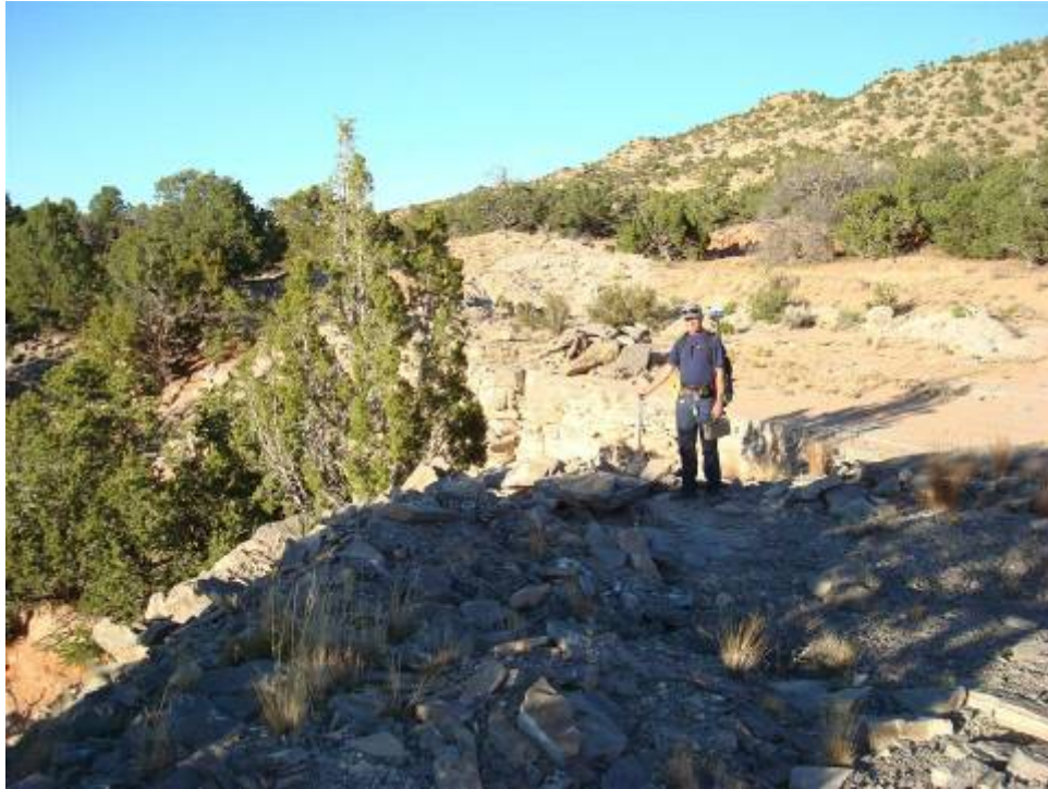
Photo 3. Yucca Mine site, waste rock piles