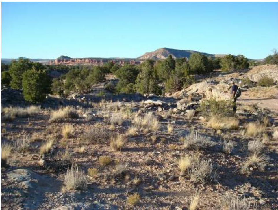
Photo 2. Yucca Mine site, towards the north