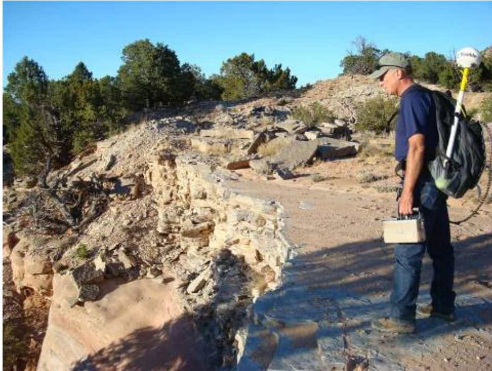
Photo 4. Yucca Mine site, waste rock piles pushed off mesa into a box canyon