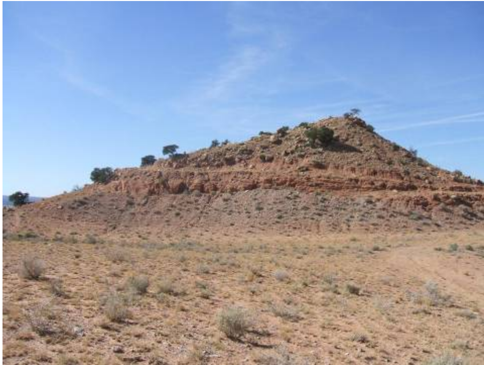
Photo 1. Haystack No 2 mine site, towards the west