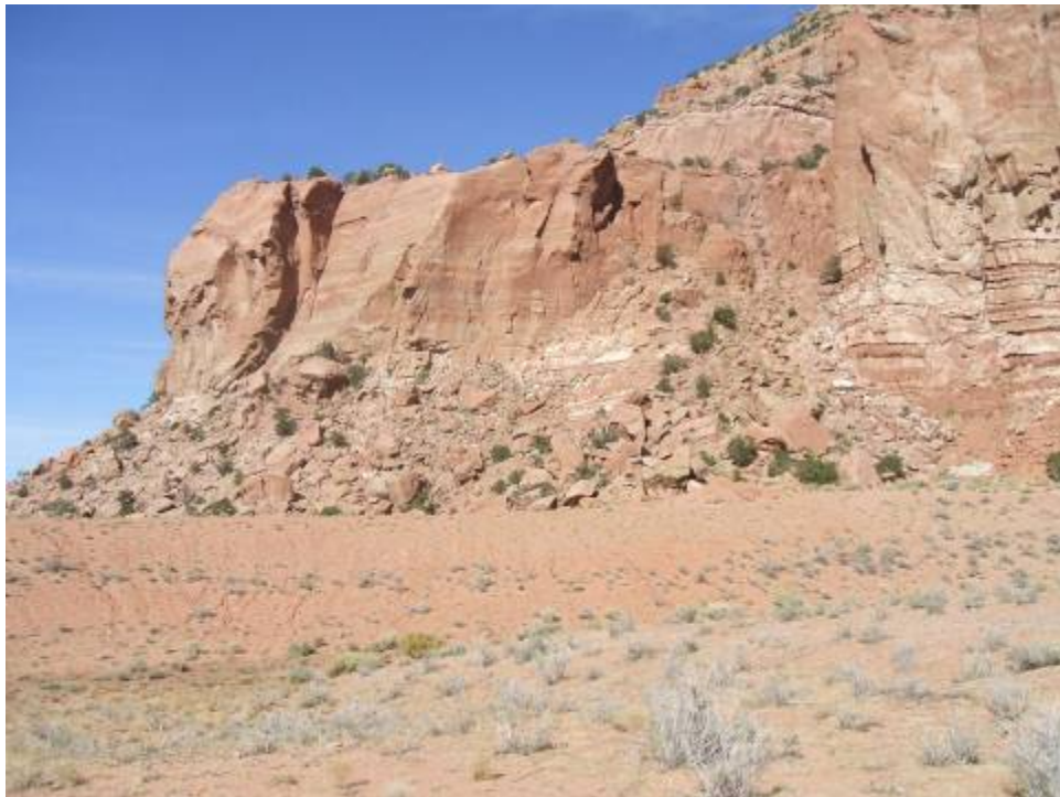
Photo 2. Haystack No 2 mine site and open recessed area, towards the north