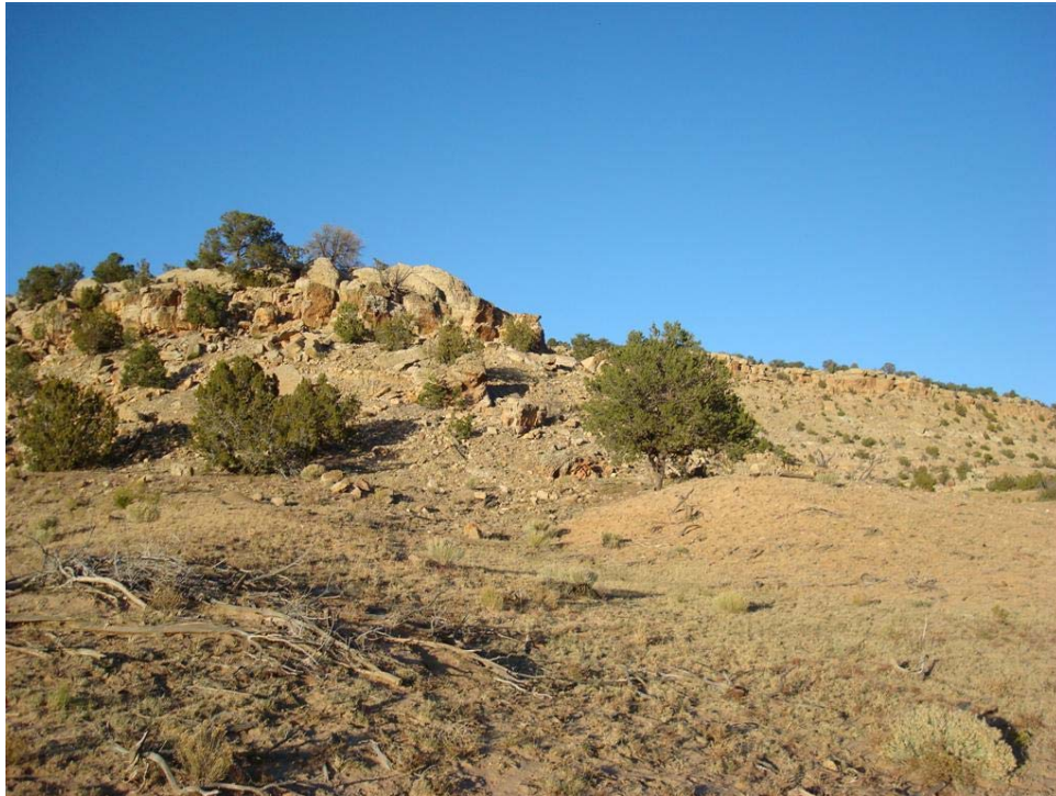
Photo 1. Junior Mine site, towards the north