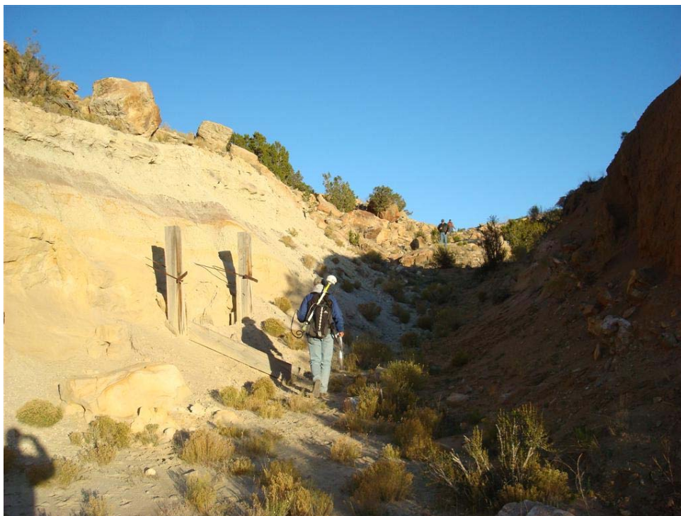
Photo 2. Junior Mine site, ravine towards the north