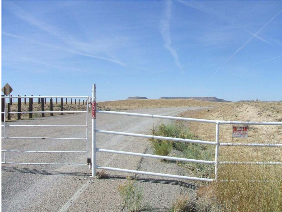
Photo 1. Locked gate on road leading towards Dysart No. 1 mine site