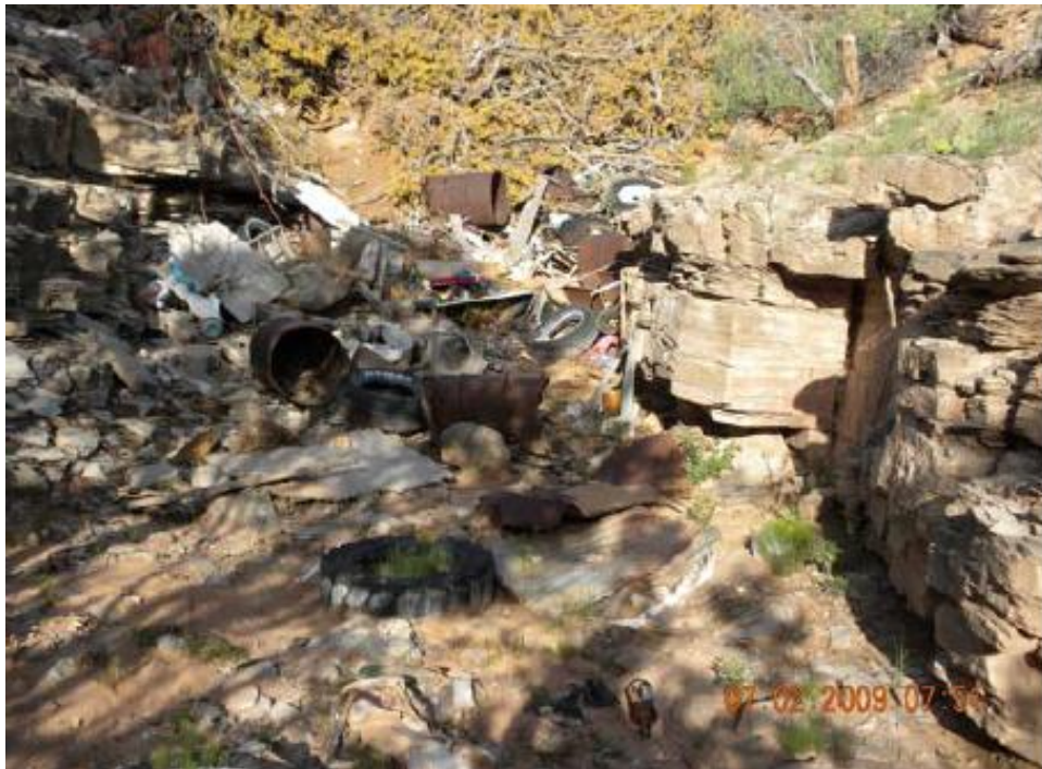
Open pit area (Section 25 #363) bulldozer cut into limestone, current trash dump area