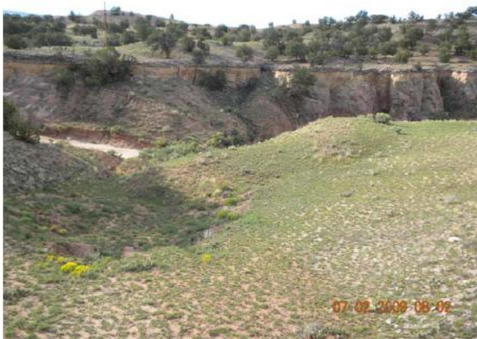
Open pit area (Section 25 #363) facing southeast, overlooking mined area