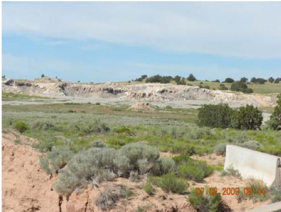
Aggregate pit area (Section 25 #366) facing the southwest