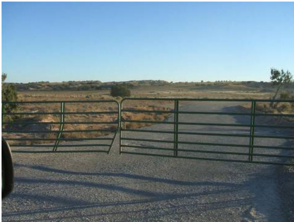
Photo 2. Locked gate leading towards Section 25 mine site