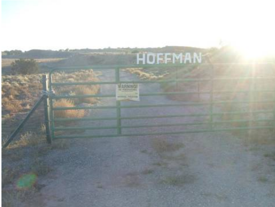
Photo 1. Locked gate on road leading towards Section 25 mine site