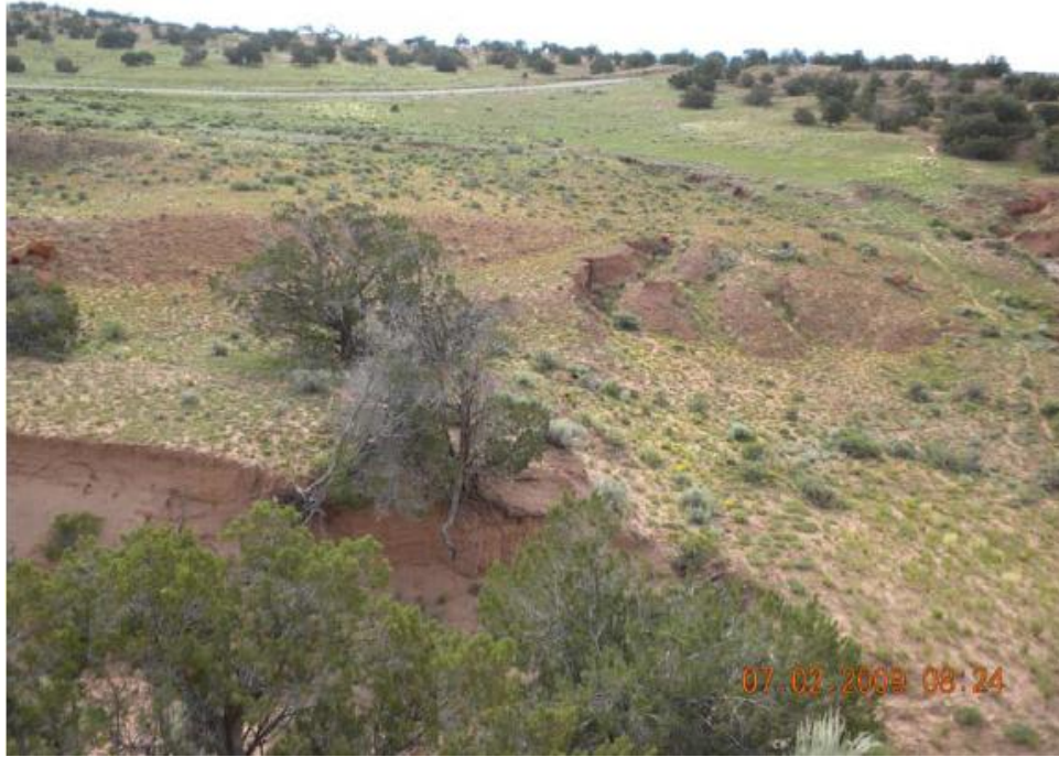
Open pit area (Section 25 #363) facing east towards possible reclaimed area