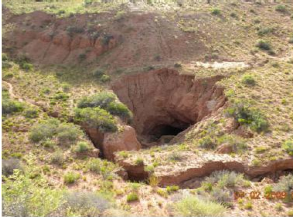
Open pit area (Section 25 #363) adit

The following photographs were collected by the New Mexico Environment Department: