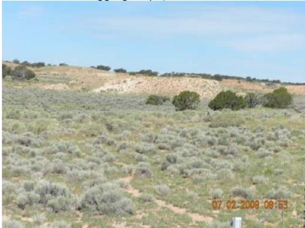
SEQ area (northwest corner of Section 25 #366) facing the west