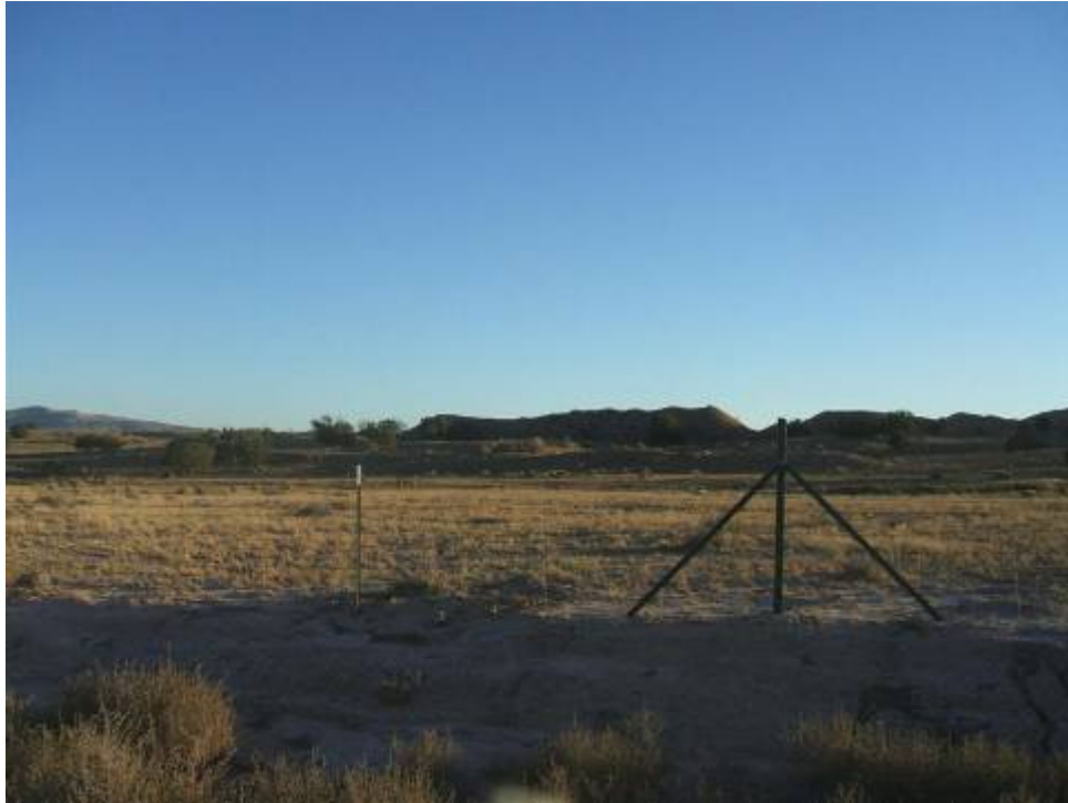
Photo 3. Fenced area leading towards Section 25 mine site