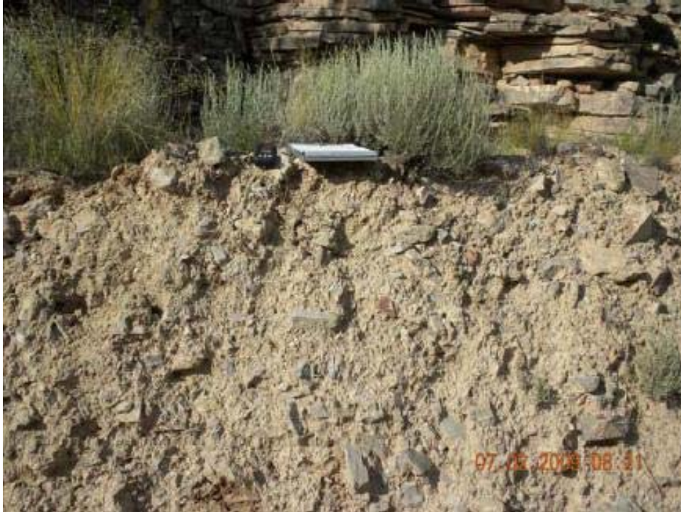
Open pit area (Section 25 #363) waste rock near drainage