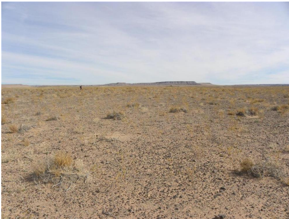
Photo 2. Mel Gardner mine site