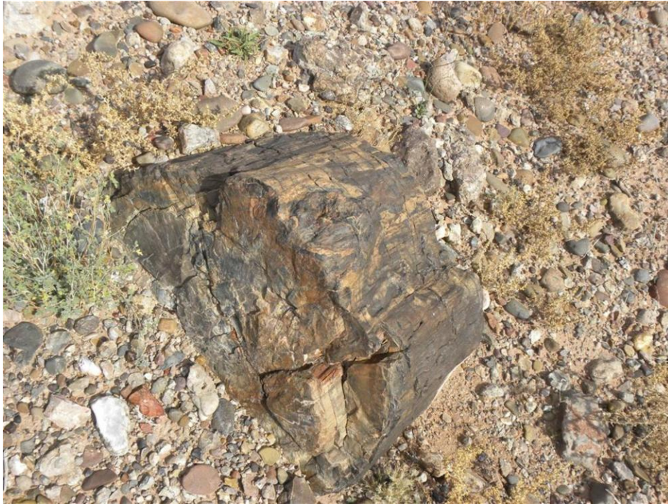
Photo 3. Mel Gardner mine site, petrified wood, with elevated gamma readings