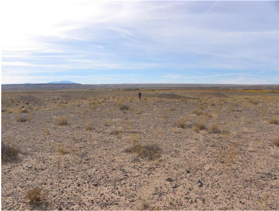
Photo 1. Mel Gardner mine site