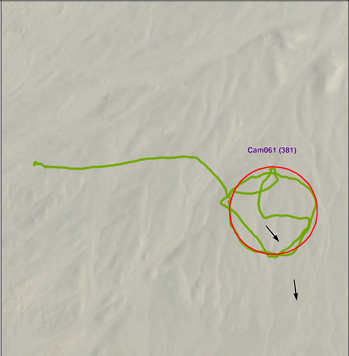
Figure 1 - Gamma Radiation Measurements, Above Two Times Cam061 (381) Coalmine Mesa Chapter, Navajo Nation