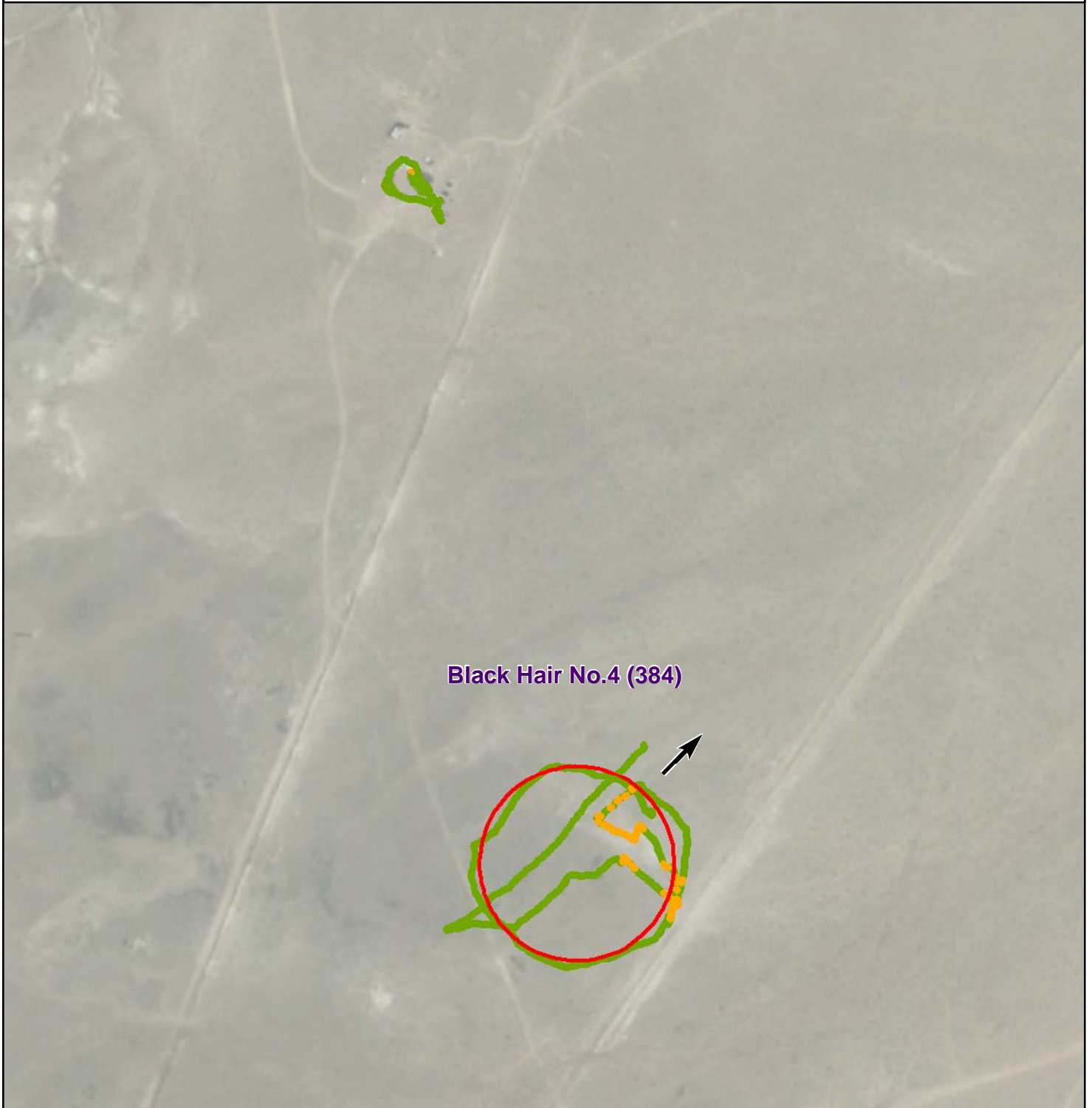
Figure 1 - Gamma Radiation Measurements, Above Two Times Background Black Hair No.4 (384) Cameron Chapter, Navajo Nation