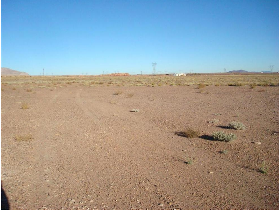
Photo 1. Black Hair No. 4 mine site