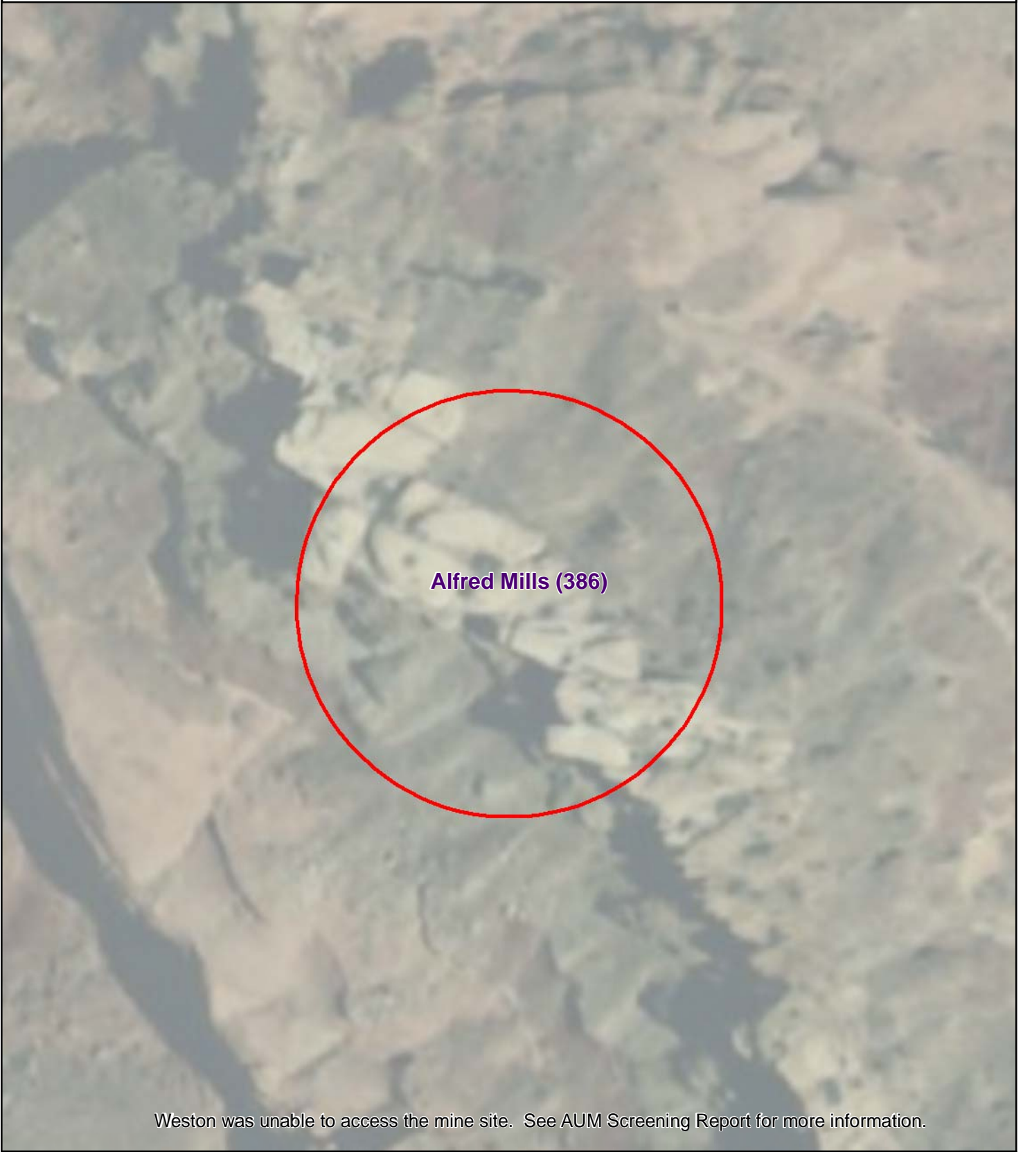
Figure 1 - Inaccessible Alfred Mills (386) Ojato Chapter, Navajo Nation

Weston was unable to access the mine site. See AUM Screening Report for more information.