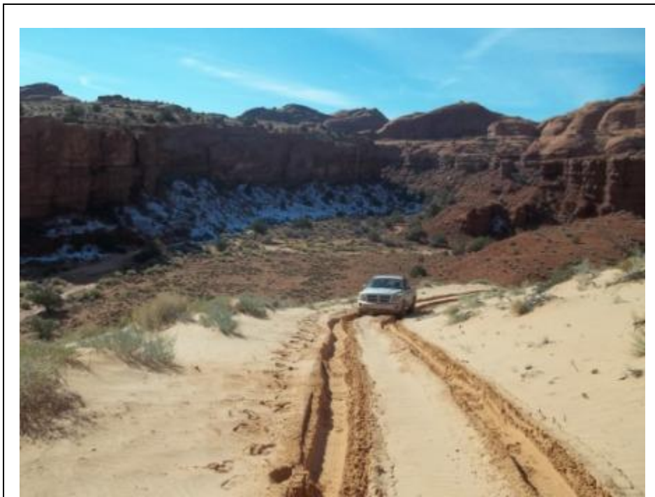
Photo 2 Impassable road in direction of the site