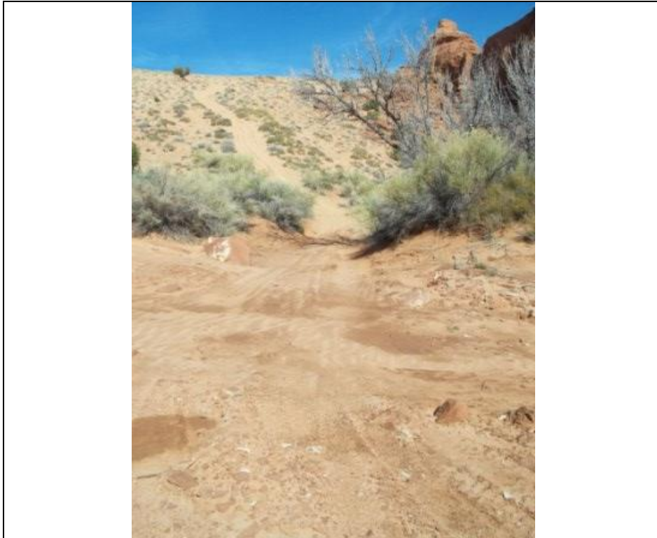
Photo 1 Impassable road in direction of the site