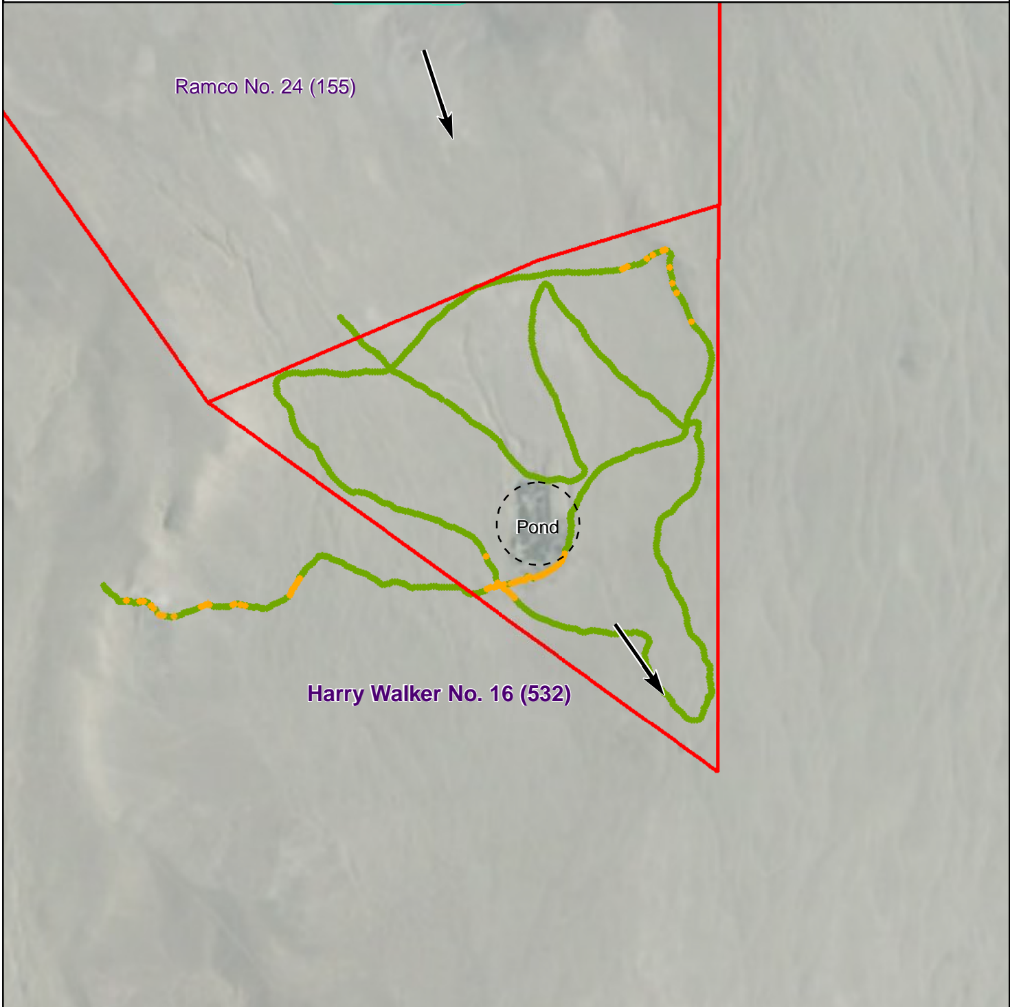
Figure 2 - Gamma Radiation Measurements Ramco No. 24 (155) Coalmine Mesa Chapter, Navajo Nation