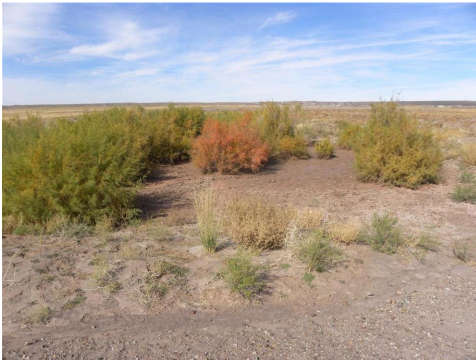
Photo 2. Harry Walker No. 16 mine site, small pond area