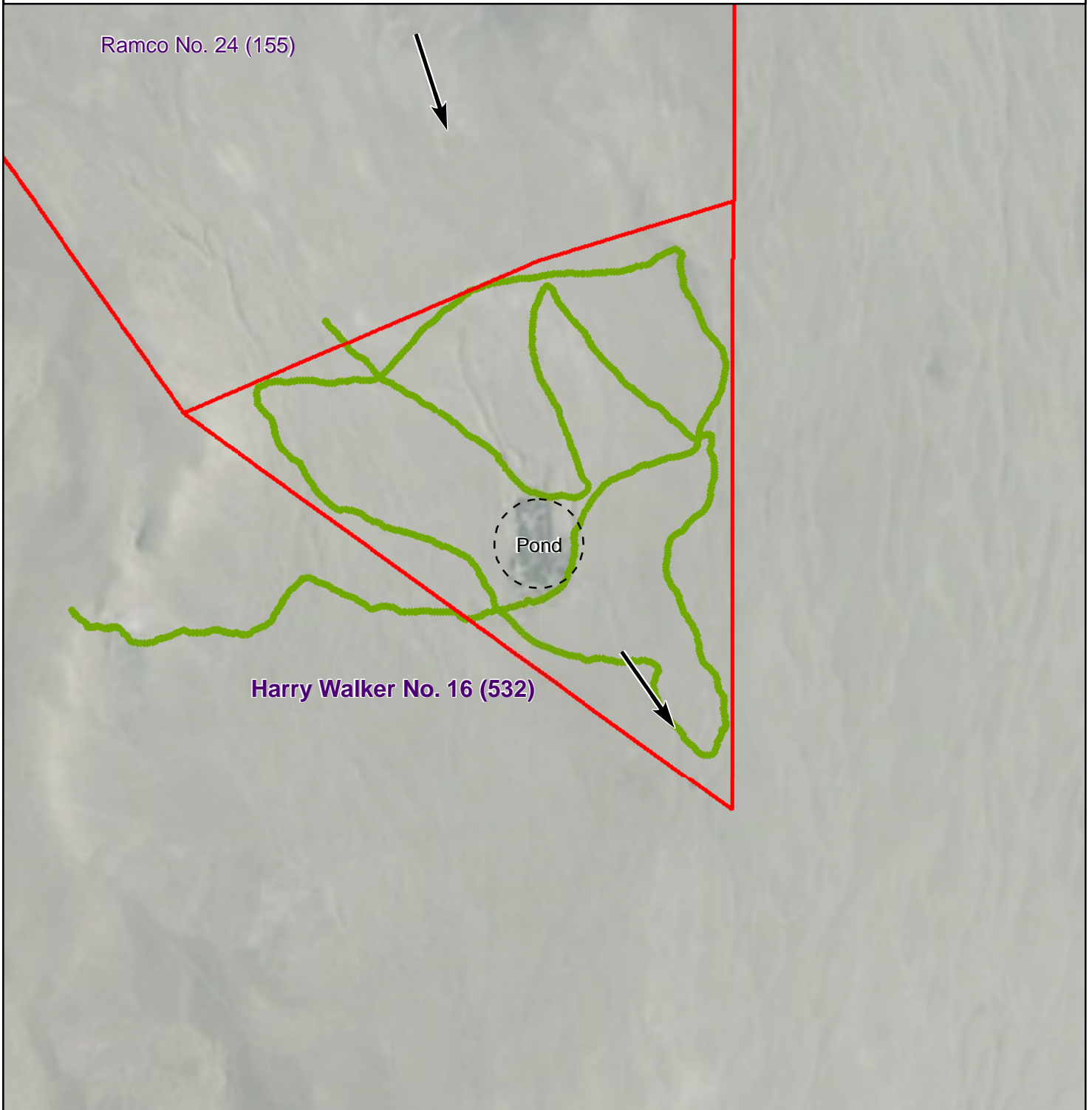
Figure 1 - Gamma Radiation Measurements, Above Two Times Background Ramco No. 24 (155) Coalmine Mesa Chapter, Navajo Nation