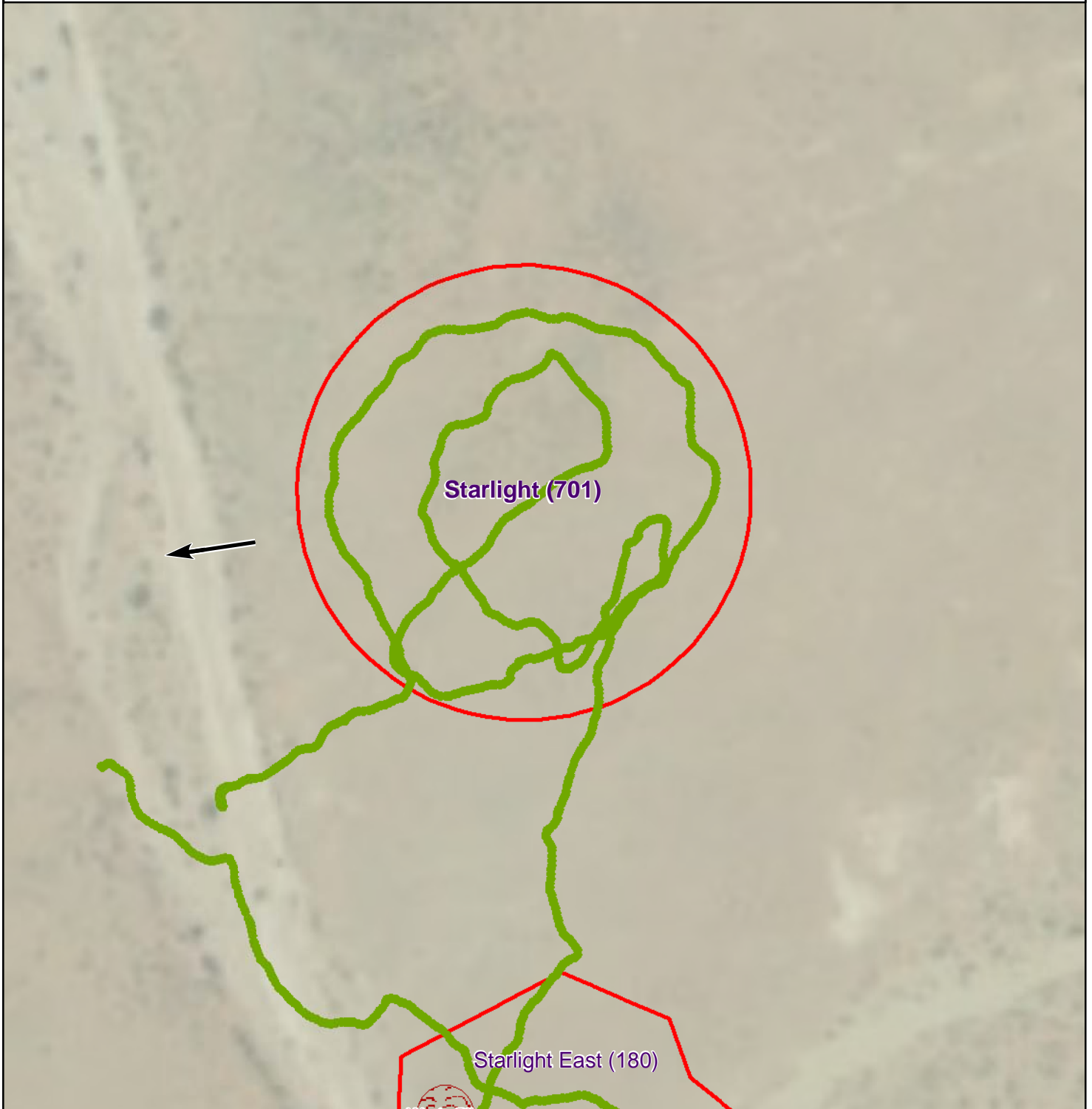
Figure 1 - Gamma Radiation Measurements, Above Two Times Background Starlight (701) Oljato Chapter, Navajo Nation