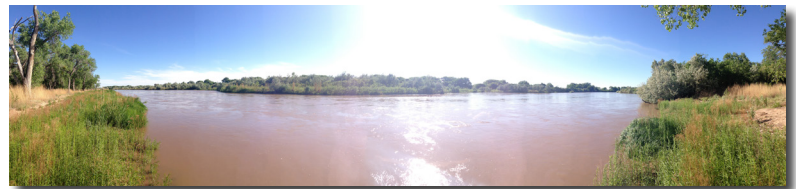
Valle de Oro National Wildlife Refuge during their 2016 “Abrazos- A Community Celebration of Environmental Justice Day” event.

The project uses surveys, dialog with community leaders, public outreach, and training to establish baseline community knowledge around environmental and public health concerns and the relationship between the Refuge and sustainable solutions to the concerns, and to raise awareness of the Refuge and its development and encourage community participation. The Refuge serves as a model for the DOI for the incorporation of Urban Refuge Standards of Excellence and the development of new Urban National Wildlife Refuges nationwide.