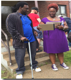
EMI participant engages with community members during air quality testing.

The EJ IWG hosted an EMI workshop at the 2016 National Environmental Justice Conference (NEJC), which featured presentations on climate justice projects from students attending Minority Serving Institutions. Students were able to share their work and gain valuable insight from other professionals and activists in the environmental justice movement.