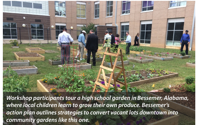
Workshop participants tour a high school garden in Bessemer, Alabama, where local children learn to grow their own produce. Bessemer's action plan outlines strategies to convert vacant lots downtown into community gardens like this one.

The Winder Housing Authority in Winder, Georgia , received technical assistance to develop a community kitchen and community garden in the city's new Wimberly Center for Community Development, which is in a former middle school building.