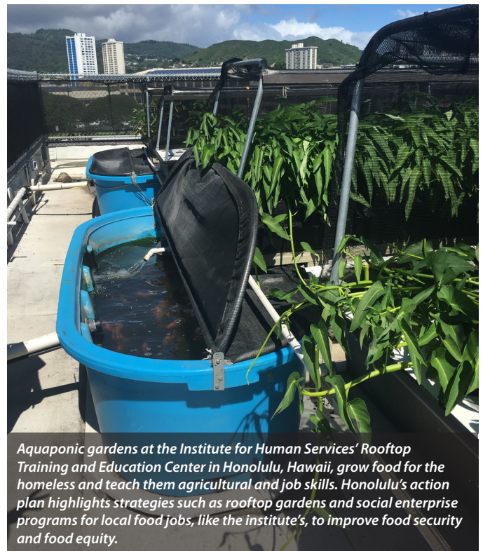
Aquaponic gardens at the Institute for Human Services' Rooftop Training and Education Center in Honolulu, Hawaii, grow food for the homeless and teach them agricultural and job skills. Honolulu's action plan highlights strategies such as rooftop gardens and social enterprise programs for local food jobs, like the institute's, to improve food security and food equity.