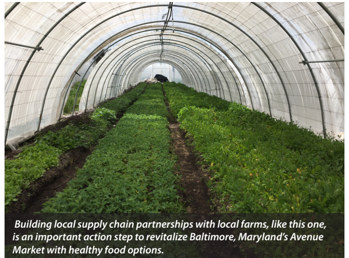
Building local supply chain partnerships with local farms, like this one, is an important action step to revitalize Baltimore, Maryland's Avenue Market with healthy food options.