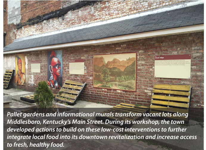
Pallet gardens and informational murals transform vacant lots along Middlesboro, Kentucky's Main Street. During its workshop, the town developed actions to build on these low-cost interventions to further integrate local food into its downtown revitalization and increase access to fresh, healthy food.

With its new action plan, Somos Inc. in Crisfield, Maryland , is establishing a farmers market, community gardens, and active living opportunities downtown. The town wanted to improve residents' health and restore access to healthy, local foods, which was lost when Superstorm Sandy destroyed the town's grocery store. The assistance also focused on increasing local food-based tourism and entrepreneurship opportunities that build on the local seafood industry and natural assets.