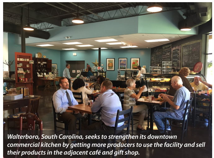
Walterboro, South Carolina, seeks to strengthen its downtown commercial kitchen by getting more producers to use the facility and sell their products in the adjacent café and gift shop.