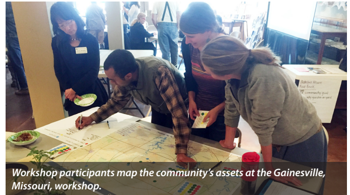
Workshop participants map the community's assets at the Gainesville, Missouri, workshop.

The Colleton Museum and Farmers Market in Walterboro, South Carolina , explored strategies to strengthen the downtown farmers market and commercial kitchen and help revitalize downtown as a local foods and arts destination.