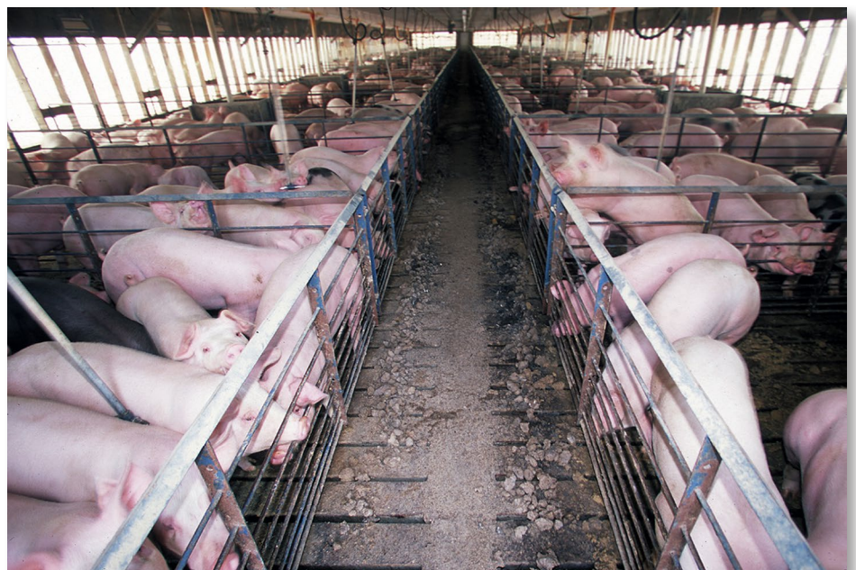
Hog farms produced 220 billion pounds of manure in a single year.

It's not just animals, though. Chemicals in pesticides, herbicides, fungicides, and fertilizers can also cause water pollution. Pesticides, herbicides, and fungicides are used to kill pests such as crop-eating insects and to control the growth of weeds and fungi. Fertilizers are used to feed crops and make them grow faster and healthier. Unfortunately, chemicals used to kill bugs and weeds can also damage other things. These chemicals can enter and contaminate water in several ways—through use and overuse in or around the water, from runoff, or by the wind. And their effects can be deadly. The chemicals can kill fish and other wildlife, poison food sources, and destroy the habitat that small animals use to hide from predators.