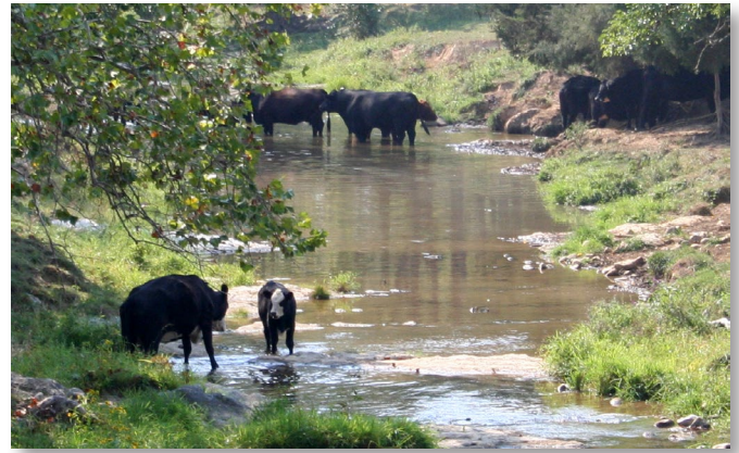
Fencing off natural streams from cattle will reduce sedimentation and nutrient pollution.

Similarly, farmers can limit the damage of pesticides, herbicides, and fungicides. By doing some research into the soil makeup, the climate conditions, and the pest history of