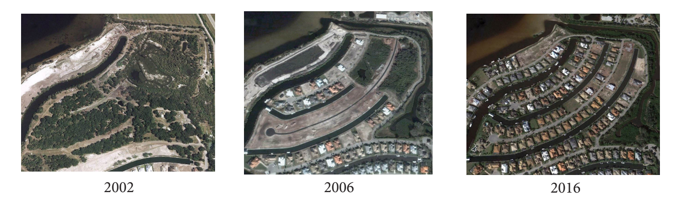
Tampa area wetland fill for development.

Changes in Hydrology: Drought, ditching, and other local or regional factors (e.g., construction of The Intracoastal Waterway) can change hydrology making wetlands appear drier than they would under unaltered conditions. When these areas are proposed for development, landowners may not be aware that their property contains wetlands and may fail to seek permits, leading to uncompensated and perhaps avoidable losses.