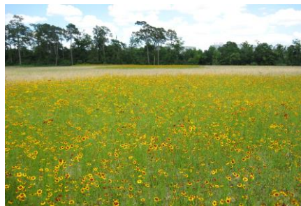
Wildflowers on the cap provide pollination services.