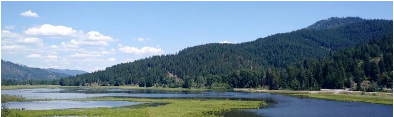
Agriculture-to-wetland project at the Lower Basin of Coeur d'Alene River Superfund site in northern Idaho.