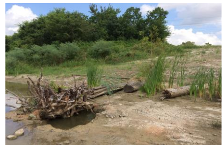
The site team reused cleared trees on the site as habitat features.