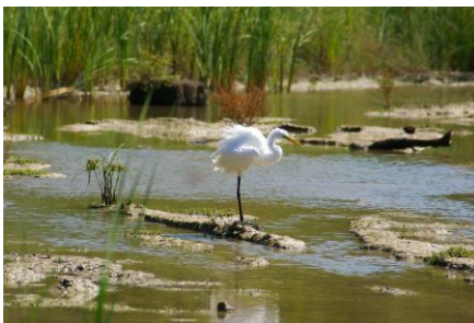
The new wetland habitat supports migratory birds.

When the U.S. EPA site team and Phillips 66 began discussing closure of a waste containment cell, the site team recognized an opportunity to protect the existing ecosystem and revitalize ES at the Bayou Verdine cleanup site in Lake Charles, Louisiana. Phillips 66 collaborated with the U.S. EPA and community stakeholders to complete a work plan that supported ecological land reuse. During cleanup, the U.S. EPA and Phillips 66 implemented a greener cleanup strategy with BMPs to protect the existing ecosystem. BMPs included: minimizing activity along the shore to preserve riparian habitat, keeping large trees by adjusting access road construction or by pruning them, reusing cleared trees on the site to create new habitat, and relocating fish before constructing the containment cell from an existing pond. To repair and revitalize the ecosystem, Phillips 66 created pond and wetland habitat around the containment cell and constructed a bio-swale to hydraulically connect the new habitat to Bayou Verdine. Additionally, they established a pollinator habitat on the capped containment cell. The revitalized Bayou Verdine site now provides habitat for wetland birds, fish, aquatic wildlife and pollinators. The functional ecosystem, in turn, contributes to human well-being (U.S. EPA, 2017f).