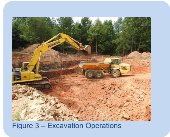
Figure 3 – Excavation Operations

The IM activities also tested two cleanup technologies to be considered in the Corrective Measures Study (CMS). The first test evaluated a soil cleanup method using soil vapor extraction (SVE). The results showed that air permeability within the clay-rich soil is irregular and so SVE would likely be ineffective. However, this technology is not likely to be necessary because most of the VOC mass in soil has already been removed by excavation. The second test consists of a 1-year-long pilot study using anaerobic bioremediation to destroy VOCs in shallow groundwater beneath the VOC source area (bioremediation uses the introduction or enhancement of naturally-occurring microorganisms in the aquifer to metabolize or breakdown pollutants; i.e., they use the VOCs as a source of energy or “food”). The year-long pilot study is currently concluding and the results indicate that bioremediation can destroy VOCs in groundwater when favorable aquifer conditions are established and maintained.