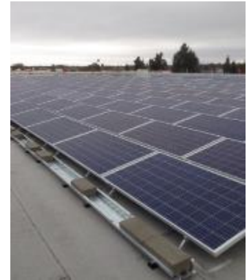
Sacramento, CA 213 kW