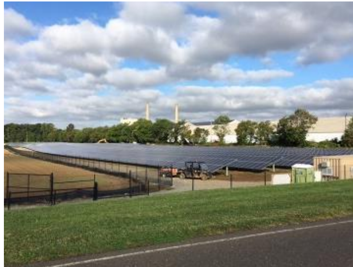
Freehold, NJ 1990 kW