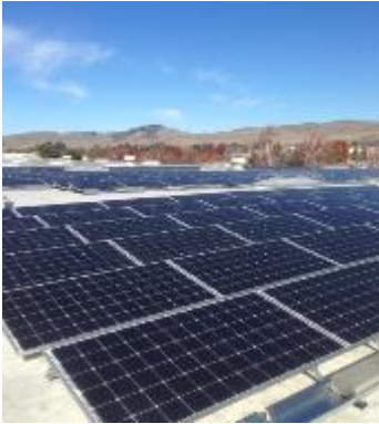
Livermore, CA 369 kW