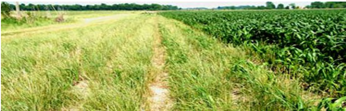
Glyphosate resistant Italian ryegrass