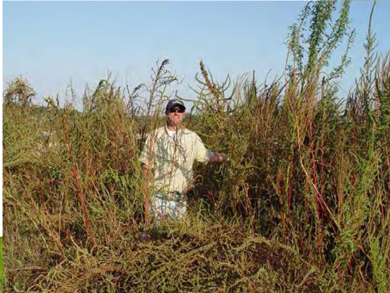
Palmer amaranth, Amaranthus palmeri