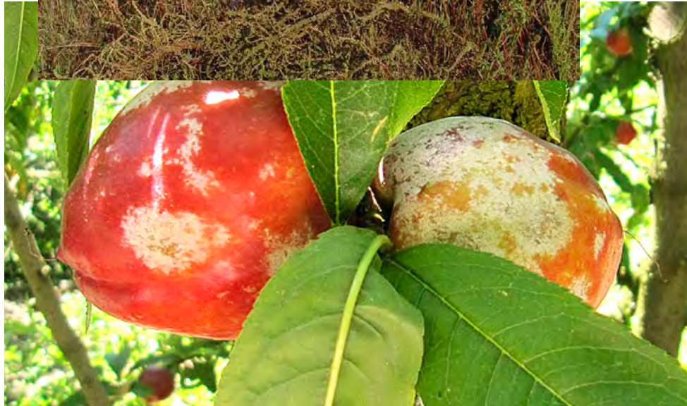
Powdery Mildew Sphaerotheca pannosa Host: Prunus persica var. nucipersica - Nectarine APS Publication number F100127