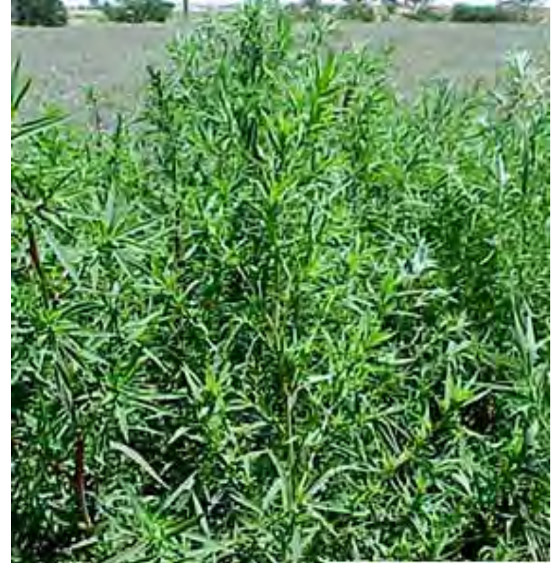
Glyphosate resistant Kochia