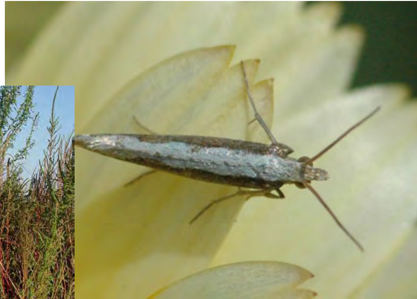
Diamondback moth, Plutella xylostella