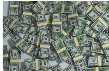
Above: Photograph of cash..