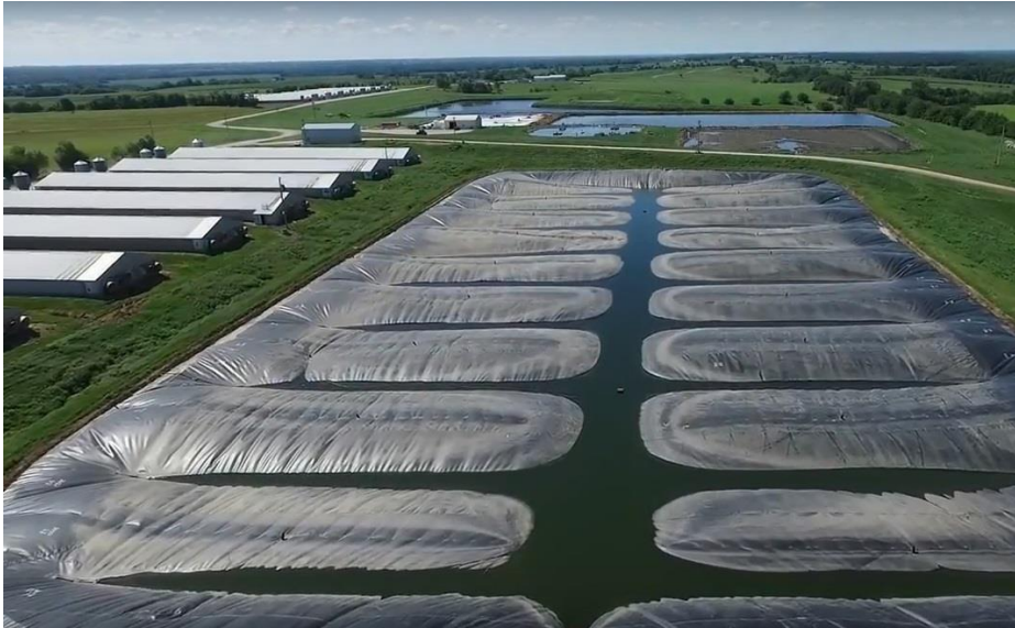
Aerial view of covered manure lagoons