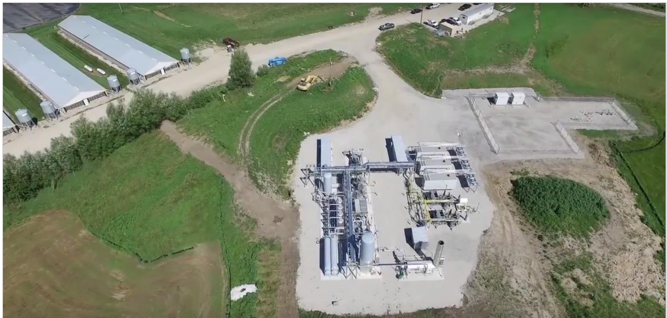
Biogas is transported through underground piping to a processing facility that removes impurities.

element MARKETS RNG produced from the project is sold to Element Markets, a marketer of biogas and introduced into the California vehicle fuel market.