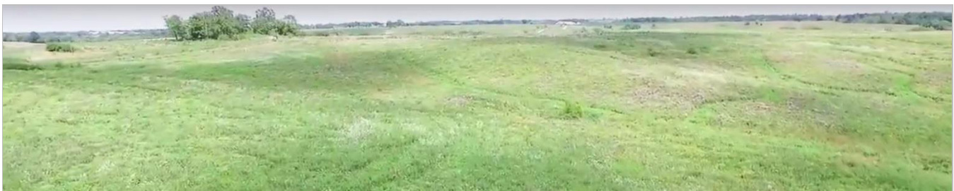
Prairie grasses, harvested and combined with manure, increase the production of biogas.