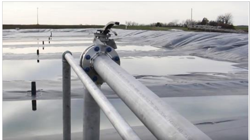
Biogas collection.

At Ruckman Farm, one of the nine hog finishing farms, manure is collected by scraper systems from buildings that house the hogs and is sent to the farm's nine covered lagoons for anaerobic digestion. The farm's lagoons are covered with 80-mil high-density polyethylene and low-density polyethylene impermeable synthetic covers. Rain that falls on the lagoons is captured and processed as storm water. Each lagoon is equipped with a flare system for emergency backup.