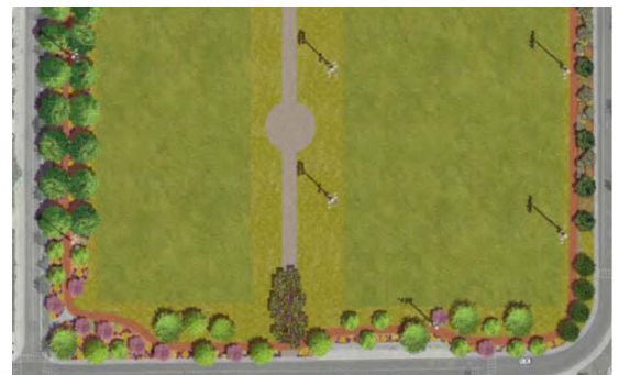
Source: University of New Mexico’s second place entry in the 2017 Campus RainWorks Challenge.