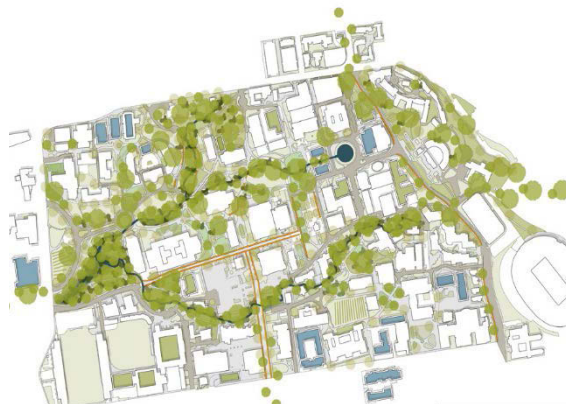
Source: University of California, Berkeley's first place entry in the 2017 Campus RainWorks Challenge.

Incomplete entries will be disqualified. Submissions should provide detailed information of sufficient quality to enable the judges to evaluate the design based on the challenge's judging criteria. A