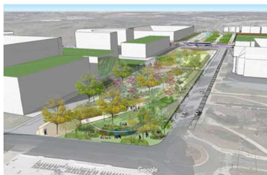
Source: University of Maryland, College Park's second place entry in the 2017 Campus RainWorks Challenge.