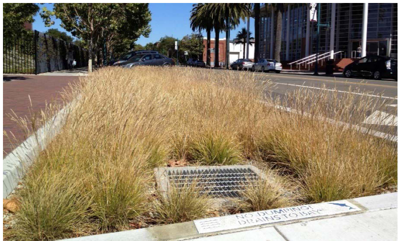
A vegetated basin allows stormwater to infiltrate and evapotranspire, preventing contaminated runoff from reaching local water bodies.