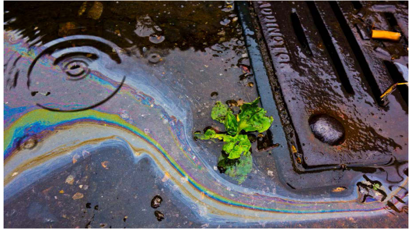
Runoff contaminated with oil and other debris is washed down a storm drain where it will be conveyed to local water bodies.

The term "green infrastructure" refers to a variety of practices that restore or mimic natural hydrological processes. While "gray" stormwater infrastructure is largely designed to convey stormwater away from the built environment, green infrastructure uses soils, vegetation and other media to manage rainwater where it falls through capture and evapotranspiration. By integrating natural processes into the built environment, green infrastructure provides a wide variety of community benefits, including improving water and air quality, reducing urban heat island effects, creating habitat for pollinators and other wildlife, and providing aesthetic and recreational value. Green infrastructure solutions can also be cheaper to install and maintain than traditional gray infrastructure.