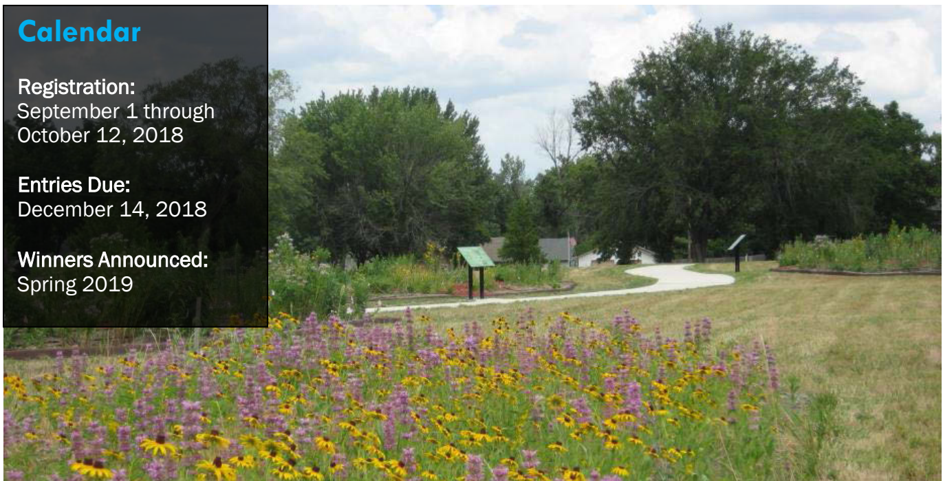
A network of rain gardens captures rain where it falls to prevent stormwater pollution, provide pollinators and other wildlife with increased habitat, and provide aesthetic benefits to the surrounding community.