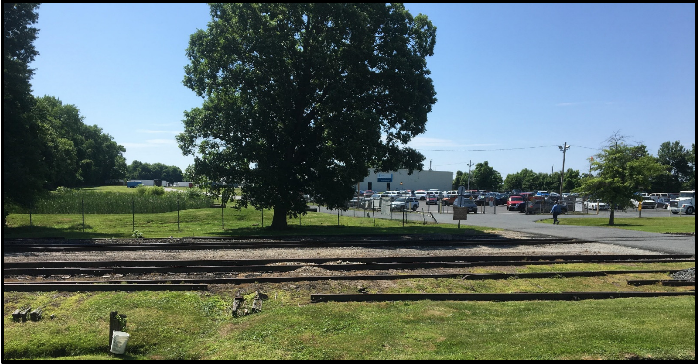
Picture 6: Adhesive Production Building – Western Portion of Facility