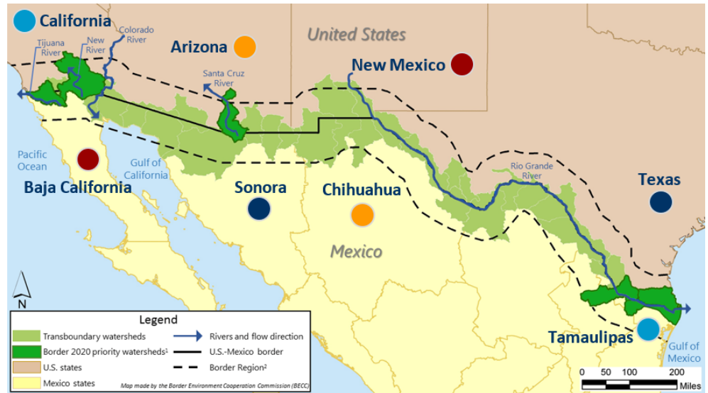
Figure 1: Map of U.S.-Mexico Border Region

EPA’s U.S.-Mexico Border Water Infrastructure Program (BWIP) funds the planning, design, and construction of high priority water and wastewater infrastructure projects along the U.S.-Mexico border. The BWIP provides hands-on management and technical oversight for pre-construction activities such as planning, engineering, environmental reviews, and design. This assistance benefits communities lacking the technical and managerial capacity needed to complete all pre-construction requirements and increases their opportunities to receive construction funding from other programs, such as Texas’ Economically Distressed Areas Program and U.S. Department of Agriculture’s Rural Development Water and Environmental Programs. The BWIP also assists communities in identifying and securing all available funding sources needed to fill construction funding gaps, ensuring access to safe drinking water and adequate sanitation often for the first time.