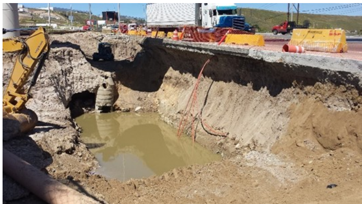
Photo 2: Repair of a broken wastewater collector in Tijuana

The Tijuana River originates in Baja California, Mexico, crosses the U.S.-Mexico Border in San Ysidro, California, and empties into the ocean just south of Imperial Beach, California. Discharges of raw and poorly treated sewage in Tijuana can impact the economy, health, and environment of U.S. communities like Imperial Beach and Chula Vista