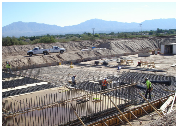
Photo 1: Construction activities for the new Sunland Park treatment Plant: (photo courtesy EPA Region 6)

The construction of a new wastewater treatment plant in Sunland Park, a small and disadvantaged community in New Mexico, started in August 2017. Camino Real Regional Utility Authority (CRRUA), the local wastewater utility, struggled with inadequate and aging infrastructure, environmental compliance challenges, and lack of managerial capacity and resources. For close to two years, EPA, the New Mexico Environmental Department (NMED) and NADB, worked closely with CRRUA to implement a capacity building plan to ensure CRRUA could effectively manage a new wastewater treatment plant. EPA provided more than $85,000 to implement the plan and the technical assistance necessary to complete all pre-construction activities. EPA and NMED also funded the construction of the $12.7 million treatment plant. EPA contributed $9 million and NMED provided the additional $3.7 million in state funding. The treatment plant will improve access to sustainable wastewater treatment services to approximately 6,438 residents of Sunland Park and Santa Teresa and will greatly reduce the risks of untreated or inadequately treated wastewater discharges.