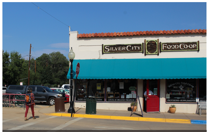
The Silver City Food Co-op in New Mexico brings residents into the heart of downtown while providing a source of fresh, local food.