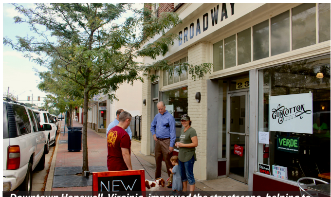
Downtown Hopewell, Virginia, improved the streetscape, helping to attract new food businesses.

In support of its goal to become a more healthy, walkable, and bikeable community, the Hopewell Downtown Partnership in Hopewell, Virginia , explored creating a new kitchen incubator in a downtown building that could support new food entrepreneurs and catalyze new businesses to locate in vacant storefronts. The community also planned how to strengthen the downtown farmers market and encourage healthy living for all Hopewell residents.