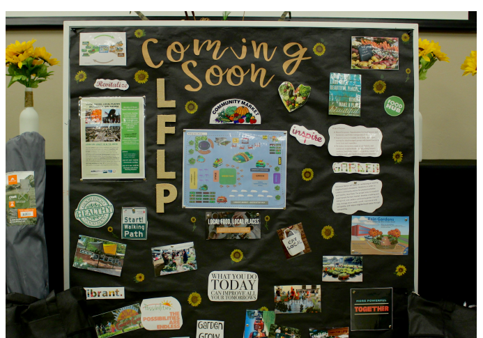
In Anadarko, Oklahoma, the Delaware Nation explored the community's vision for a gathering space that encouraged healthy eating and exercise.

The city of McCrory, Arkansas , created a plan to comprehensively address barriers to good nutrition and physical activity by planning for a thriving farmers market that improves access to healthy, local foods; a central gathering place that anchors Main Street; walkable and bikeable streets that connect community assets and healthy places; and a strong local food economy.