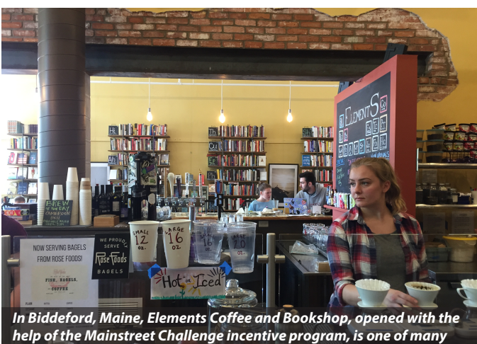
help of the Mainstreet Challenge incentive program, is one of many new food-based businesses downtown.

Working with the town of Duck Hill, Mississippi , and the Achieving Sustainability through Education and Economic Development Solutions Partnership, Action Communication and Education Reform created a plan to use green infrastructure to address longstanding stormwater and flooding problems, improve the condition of buildings and infrastructure, encourage healthy eating and living, and engage and empower the community.