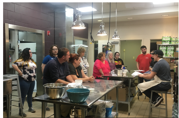
The Cannery at Hindman Settlement School in Hindman, Kentucky, offers community cooking classes and space for entrepreneurs to prepare foods for sale.