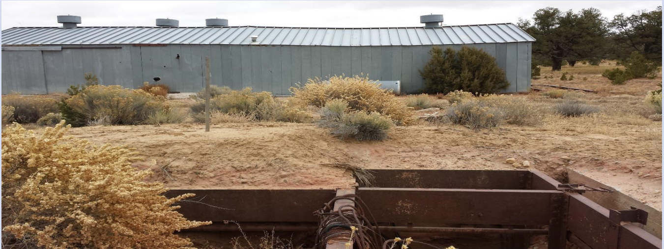
Old mining building at Black Jack #2