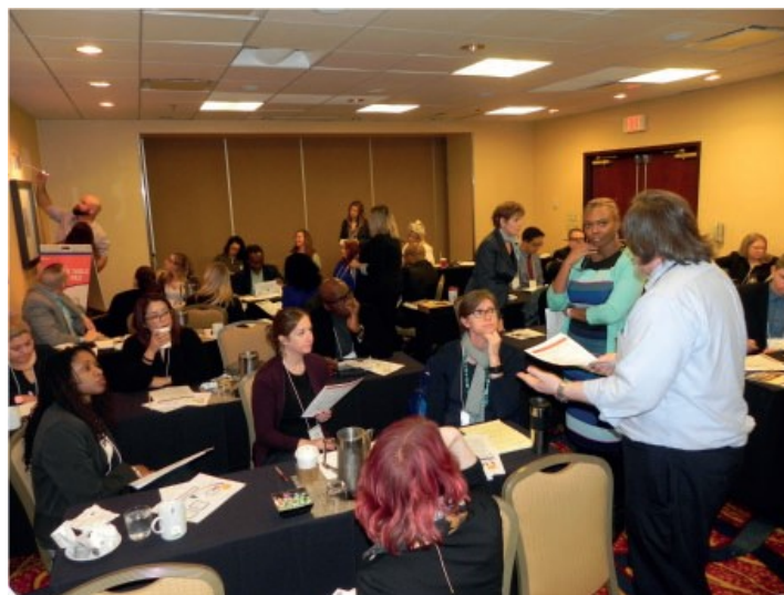
NEPA Committee Training & Workshop at the 2018 NEJC