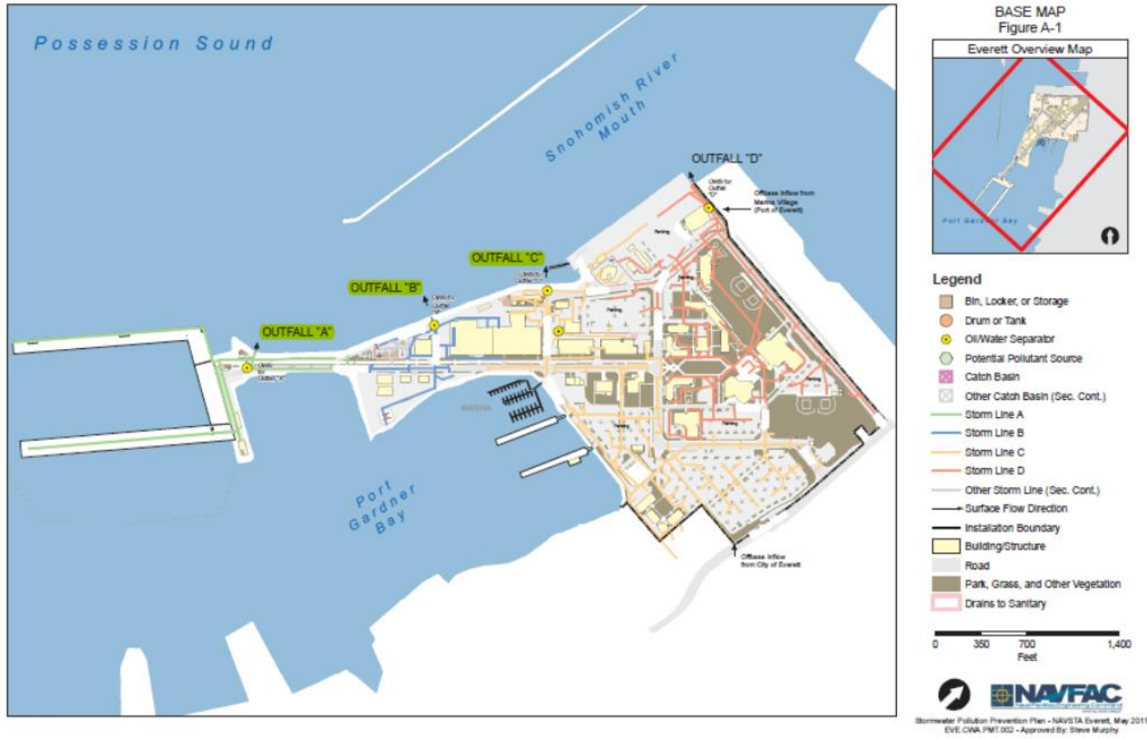
Figure 2: Detail of Naval Station Everett