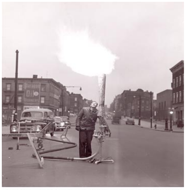
A purge burner igniting manufactured gas being replaced in a main by natural gas during the 'great conversion' in 1952