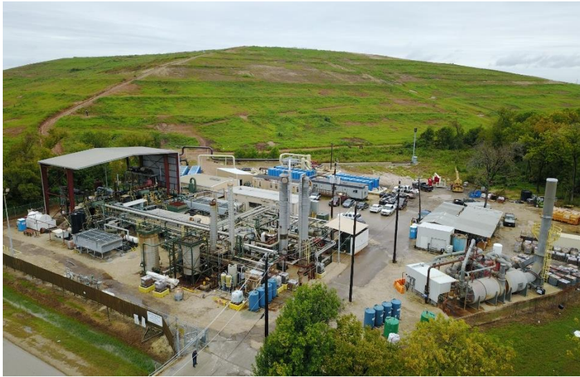
RNG from LFG – McCarty Road – Texas