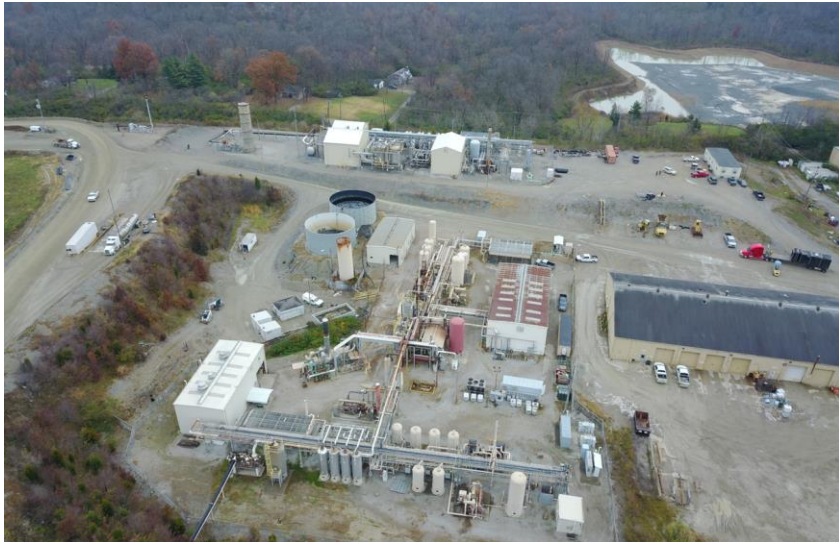
RNG from LFG – Rumpke – Ohio