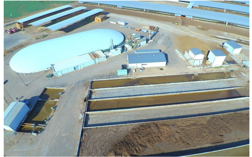
RNG from Dairy Waste – Pico – Idaho