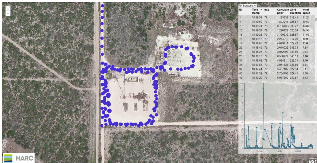
Figure 2. Hypothetical Web browser screenshot of the real-time data broadcasting system.