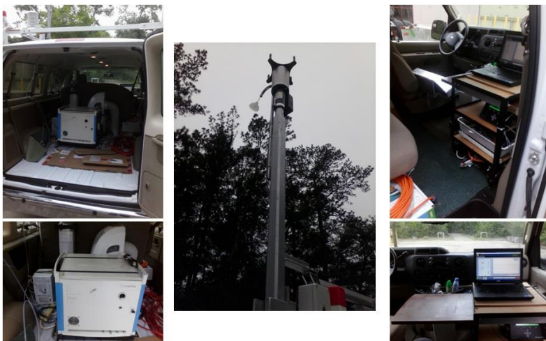
Figure 1. Mobile laboratory to be used as the basis for the proposed system.