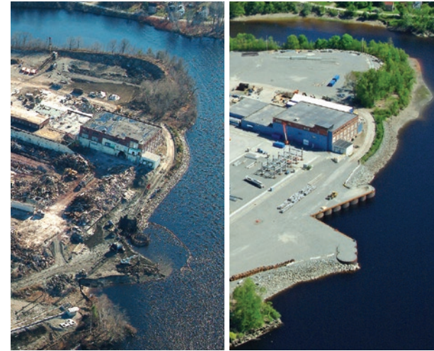
Site demolition and site development complete

Multipurpose Grants provide funding to eligible entities to carry out a range of eligible activities, including inventory, characterization and assessment of brownfield sites; community involvement related to brownfields; cleanup activities on brownfield sites owned by the applicant; and development of reuse plans and/or an overall plan for revitalization. An eligible entity may apply for up to $800,000 to address brownfield sites in a specified target area.