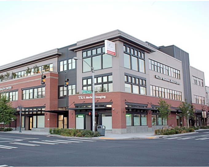
The Regional Health Center in Tacoma, WA, was once an abandoned grocery store but now provides medical and social services to over 17,000 people a year.

Assessment Grants support eligible entities as they inventory, characterize, assess and conduct planning (e.g., area-wide planning, remediation planning and reuse planning) and community involvement related to brownfield sites. An eligible entity may apply for up to $300,000 to assess sites contaminated by hazardous substances, pollutants, other contaminants or petroleum. Three or more eligible entities may apply together as a coalition to assess a minimum of five sites for up to $600,000.