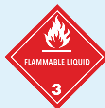
Ignitable Liquid Department of Transportation (DOT) warning label or placard