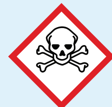
Toxic Substance Occupational Safety and Health Administration pictogram