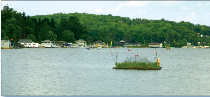
Figure 2. Watershed partners reduced the in-lake total phosphorus of Harveys Lake by installing floating wetland islands that absorb nutrients from the water.

to reduce the fuel source for algal blooms and bring the lake back into a healthy mesotrophic state. To meet the TMDL water quality goals, TP in the lake needed to be reduced by 22 percent (230 pounds per year).