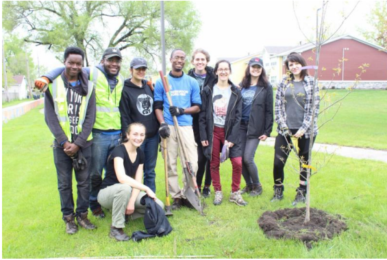
Above: Volunteers plant trees with the SCA.

Join the Student Conservation Association (SCA) in planting 100 native trees in East Chicago this Saturday, June 2nd, 9:00 am to 12:00 pm.