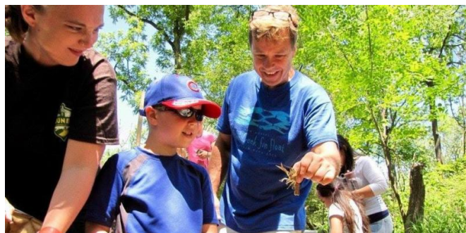
Above: Visitors enjoy fun nature activities as part of Dunes Learning Center's Get Outdoors Day, a Coastal Awareness Month activity.

Events include guided hikes, festivals, concerts, cruises aboard the W.G. Jackson research vessel, a conference on the environment, paddling excursions, fishing derbies, Washington Park Zoo's 90th anniversary celebration, a fun run 5K through Ogden Dunes, historical tours and talks, classes and workshops, volunteer days, and more.