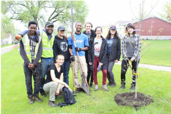
Above: Volunteers plant trees with the SCA.

Join the Student Conservation Association (SCA) in planting 100 native trees in East Chicago this Saturday, June 2nd, 9:00 am to 12:00 pm.