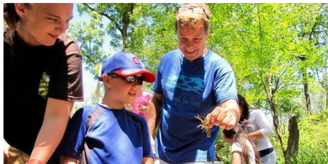
Above: Visitors enjoy fun nature activities as part of Dunes Learning Center's Get Outdoors Day, a Coastal Awareness Month activity.

Events include guided hikes, festivals, concerts, cruises aboard the W.G. Jackson research vessel, a conference on the environment, paddling excursions, fishing derbies, Washington Park Zoo's 90th anniversary celebration, a fun run 5K through Ogden Dunes, historical tours and talks, classes and workshops, volunteer days, and more.