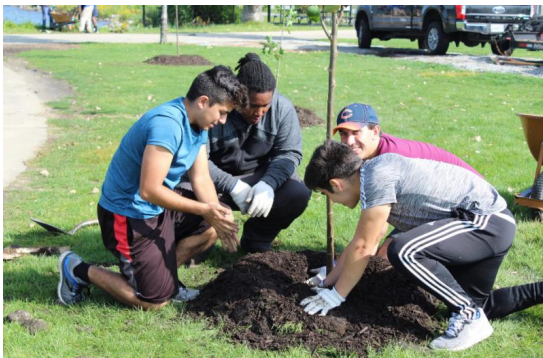
USFS and the SCA Tree Team help students plant a tree at Marquette Park.