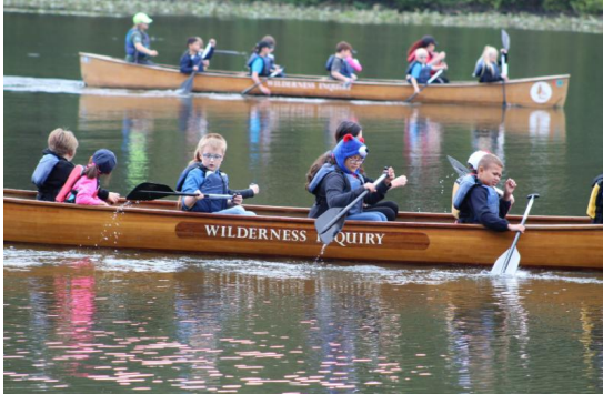
Students paddle on Lake George. In addition to paddling with Wilderness Inquiry, students participated in environmental education stations and hands-

Congratulations to our partners, led by Dunes Learning Center and LaPorte County Soil and Water Conservation District, on getting thousands of youth and community members out on waterways throughout NWI as part of Canoemobile 2018!