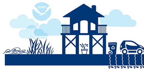
NOAA Green Infrastructure diagram

This interactive one-day training course will introduce participants to the fundamental green infrastructure concepts and practices that can play a critical role in making coastal communities more resilient to natural hazards. Through presentations featuring green infrastructure projects from Indiana, group discussions, and activities, participants will learn what they can do to support green infrastructure implementation in their communities.