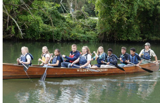
Students paddle on Trail Creek. For more photos visit Dunes Learning Center and the Trail Creek Watershed Partnership on Facebook.