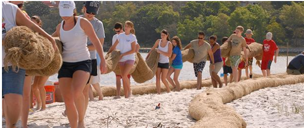
Student volunteers restore a beach as part of the Deadman's Island Restoration Project.

The program seeks to develop community capacity to sustain local natural resources for future generations by providing modest financial assistance to diverse local partnerships focused on improving water quality, watersheds, and the species and