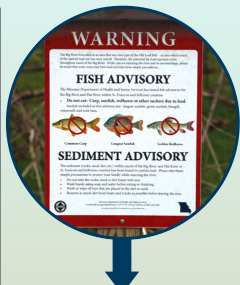
A fish advisory is in effect for the Big River.