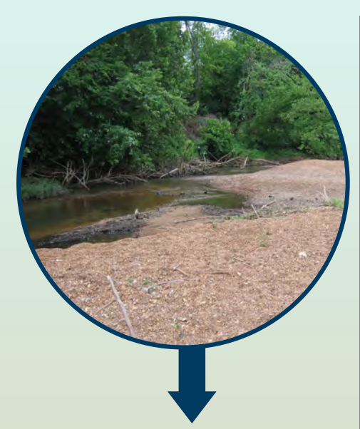
Soil and sediment may contain lead.