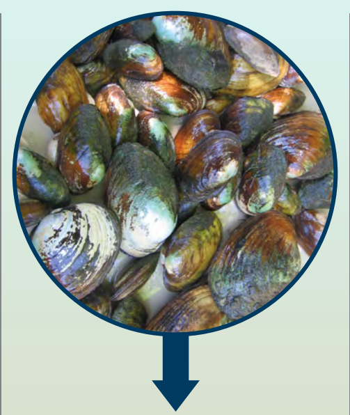
Lead in the Big River impacts fish, crayfish, and endangered mussels.