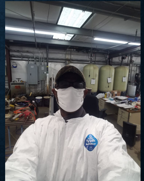
Big Valley Director of Public Works