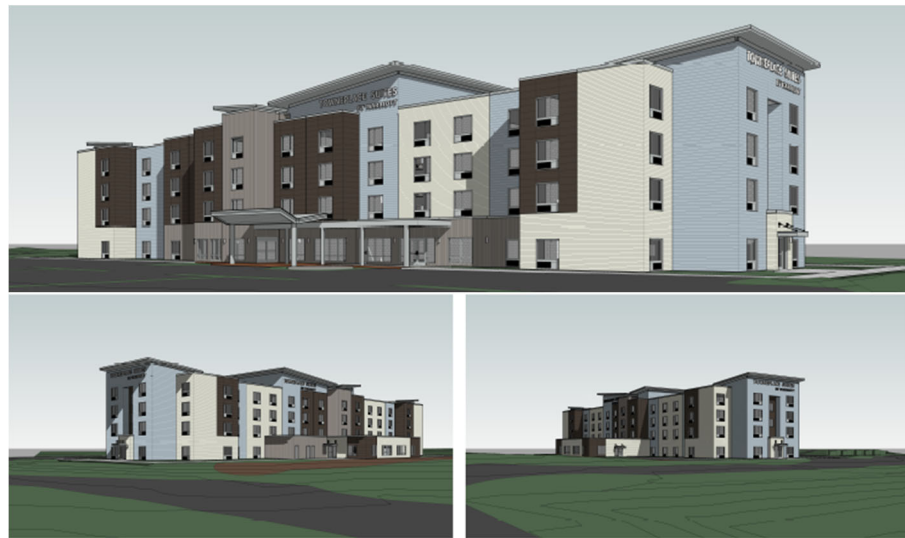
Renderings of future TownPlace Suites Marriott Hotel

This abandoned former nursing home is a prime example of how the EPA Brownfields program can provide health, environmental, social and economic benefits to a community. The cleanup, removal and reduction of exposure to contamination creates a more sustainable and healthy environment, while spurring positive economic development.