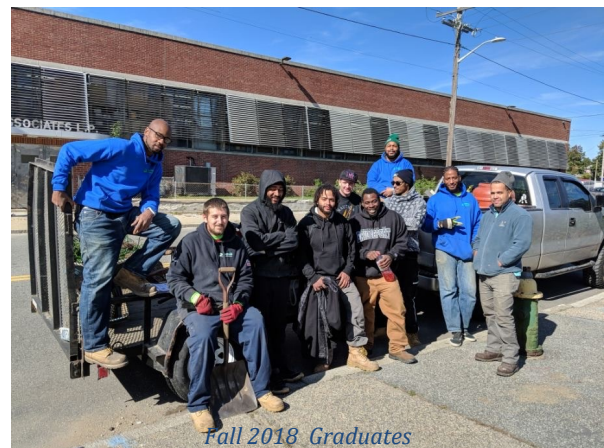
Fall 2018 Graduates

Groundwork RI’s partnership with Children’s Friend is an example of the kinds of strong partnerships Groundwork RI nurtures within its job training program. Children’s Friend improves the well-being and health of Rhode Island’s most vulnerable children and their families. Aware that fathers of children in its Head Start program need better jobs and job training, Children’s Friend created a paid job training program specifically for this group. The organization works under the belief that fathers who participate in the job training program will also improve the role they play in their children’s lives. To this end, Children’s Friend provides workshops such as, “A Father’s Impact on Child Development”, “Helping Your Child Succeed in School and in Life”, and “Parenting – A Father’s Role.”