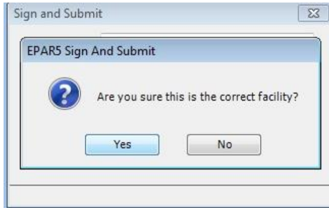
Figure 14: verify the facility

4. Click “Yes”. Users will be prompted to provide a filename and location where you would like to save the file. The Sign and Submit feature will save an archived (“zipped”) the current date, a period, the EPA ID, a period and the Format File name used to create the EDDs . (Example file name: ‘20160811.MID000000001.EPAR5.zip’). The contents of the Zipped file include text files named for the sections of the format used to create them.