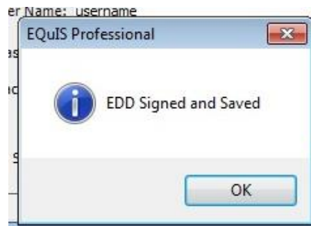
Figure 15: saved the EDD file

5. Select Save. Once the zipped EDD Package has been saved the following screen will appear.